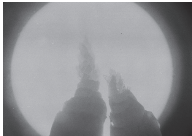
Fig. 2. IV stage at oat