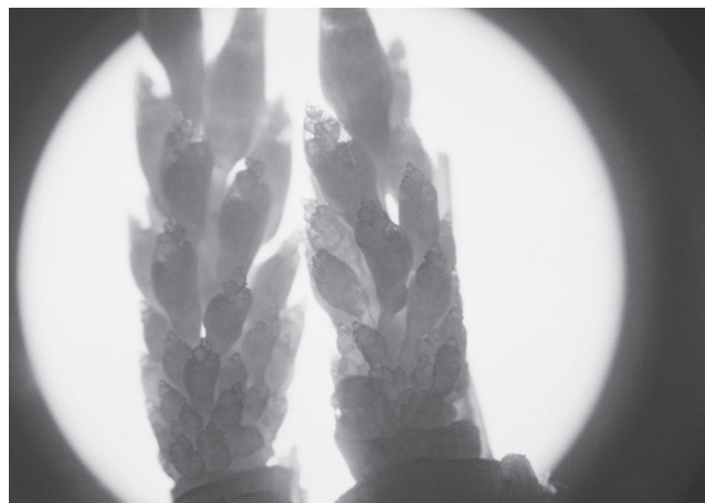
Fig. 4. VI stage at oat