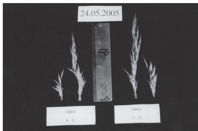
Fig. 5. VII stage at oat

As you can see, the year and the method of cultivation have a greater impact on organogenetic development. The method of cultivation, its influence highlighted by shortening the organogenetic development in organic production for 2-3 days in the first, second and third year.