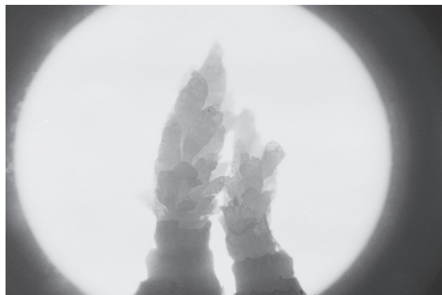
Fig. 3. V stage at oat