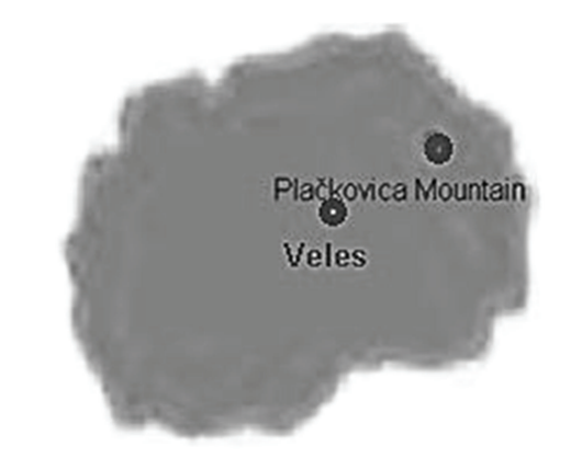
FIGURE 1: City of Veles and Plačkovica Mountain as sampling areas.

2.4. Genomic DNA Isolation. Frozen plant samples were used for DNA isolation. 0.5 to 0.7 cm disks of leaf tissue were catted with standard one-hole paper punch. Samples were kept on ice, while the procedure was done. DNA extractions were performed using REDExtract-N-Amp Plant PCR Kit (Sigma-Aldrich) following the instructions of the manufacturer. Plant disk was placed into a 1.5 mL microcentrifuge tube with 100 \mu L extraction solution and incubated for 10 minutes at 95°C. 100 \mu L of dilution solution is added and vortexes. Extract is stored at 2–8°C until use.