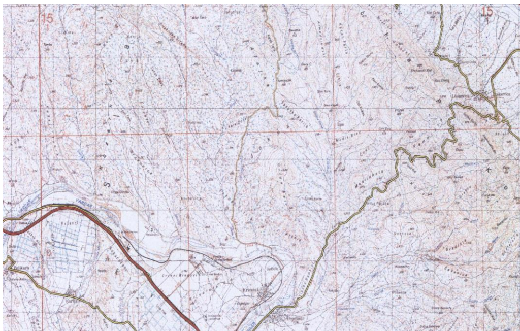
Fig. 3 Map of the area of Krivolak

Agricultural land in the area and quality forest stands are not known, but most of it is an area of steppe, the local and semi-arid character. This atmospheric feature can be priced as a quality of space, because it is a unique phenomenon in country, but despite the eventual construction of the landfill will remain large areas with no disturbed original setting.