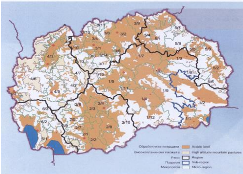
Fig.1 Use and protection of natural resources-farmland