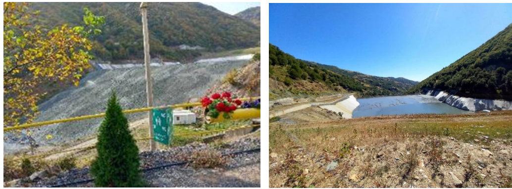
a) b) Figure 1. Flotation tailing dam, a) Dam, b) Settling Pond