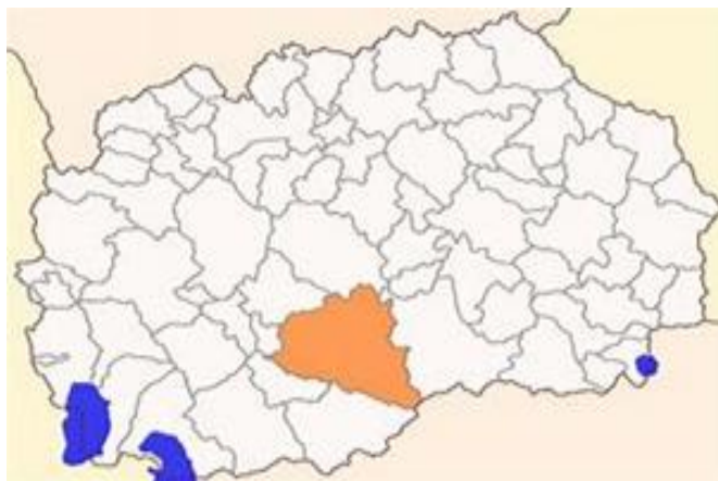
Map 1. Geographical position of the Municipality of Prilep in Republic North Macedonia