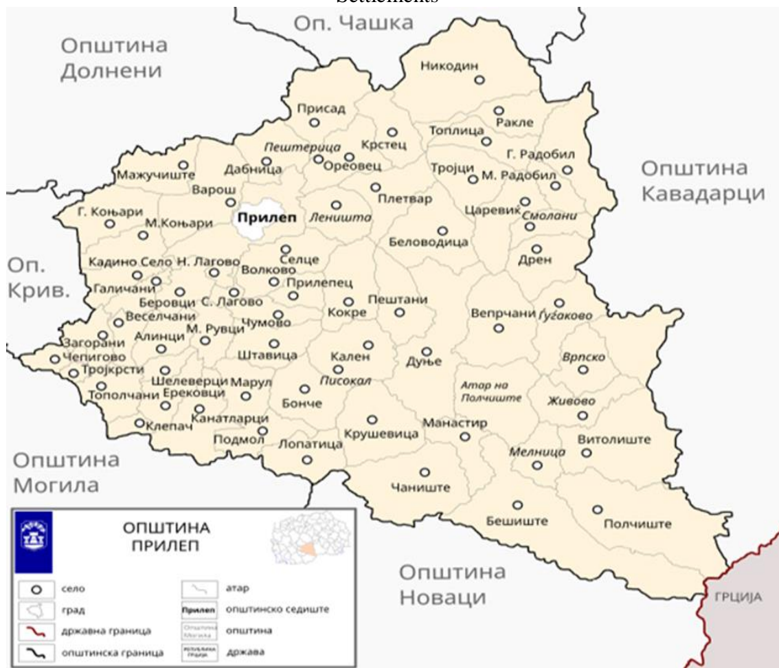
Map 2. Presentation of the Municipality of Prilep and the atari of the village Settlements

( https://www.bing.com/images/search?q=geographical+position+of+the+municipality )