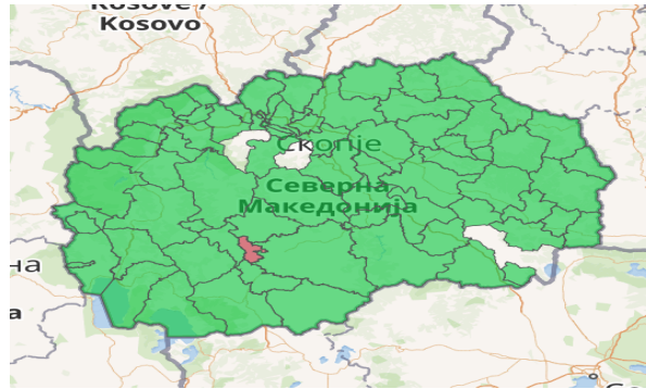
Map 7. Geographical location of the municipality of Krivogaštani in the Republic of North Macedonia

The municipality of Krivogashtani is located in the fertile Pelagonia Plain, in the Prilep Field, in its northwestern part. The municipality covers an area of 93.57 km 2 . The municipality of Krivogashtani has 14 rural settlements with its headquarters in the village of Krivogashtani and, according to the last census of 2021, has 5,167 inhabitants with an average density of 55 inhabitants per km 2 .