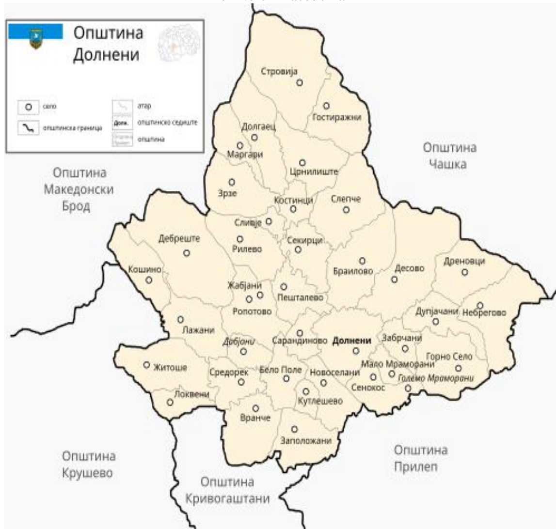
Map 6. Map of the rural areas and settlements in the municipality of Dolneni in the Republic of North Macedonia

( https://www.bing.com/images/search?q=geographical+position+of+the+municipality )