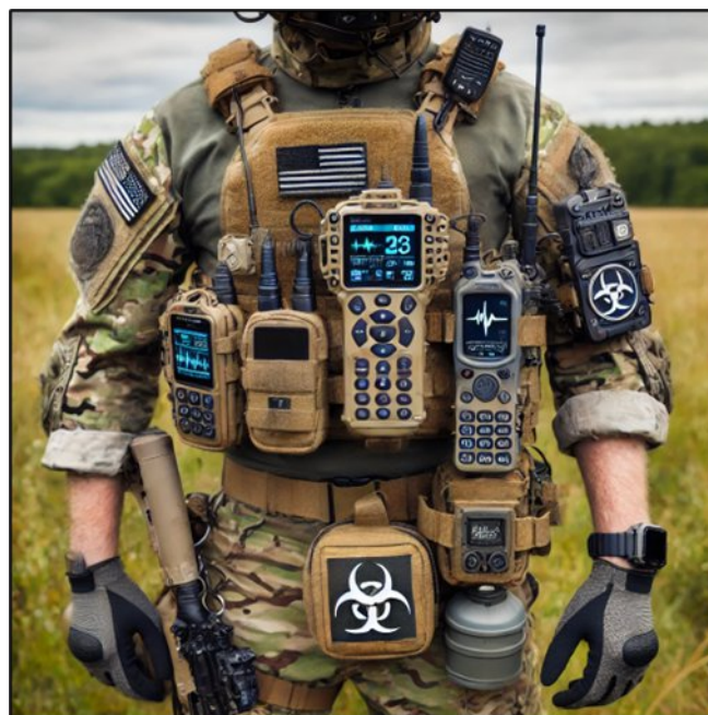
Fig. 3 – Equipment of the soldiers.

Moreover, through specialized digital gadgets, tactical units can perform digital triage which consists of several factors regarding the symptoms and severity of the biothreat, based on that triage CBRN units are appropriately allocated and alerted for taking safety measures in zone decontamination. Additionally, through digital gadgets, they can immediately access the results of the analysis and mapping system allowing them to make quick and independent military decisions if the situation requires it.