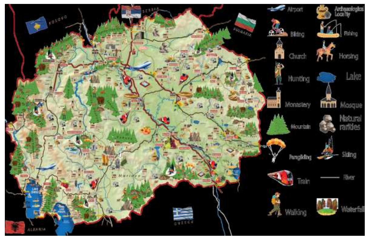
Figures 1. Tourist map of Republic Northen Macedonia (https://macedonia-timeless.com/eng)