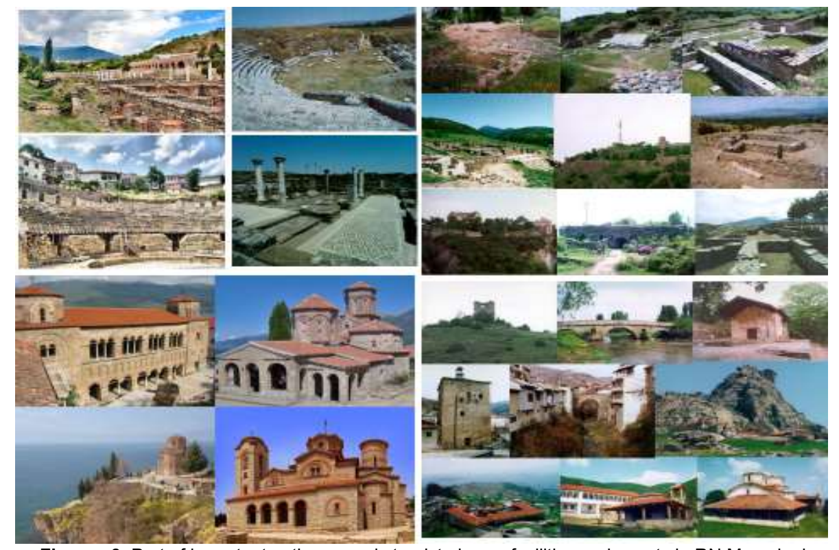
Figures 3. Part of important anthropogenic tourist places, facilities and events in RN Macedonia