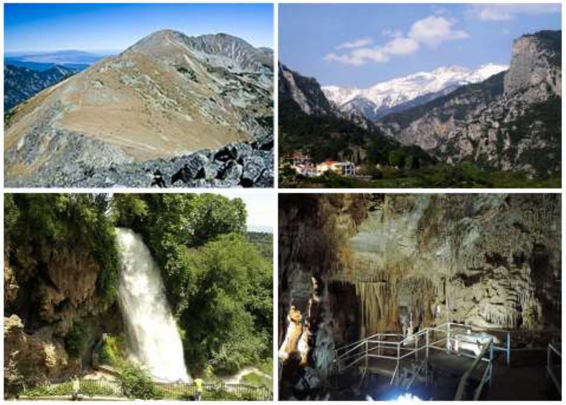
Figures 5. Part of important natural-geographic tourist places and facilities in neighboring countries that Macedonians should visit