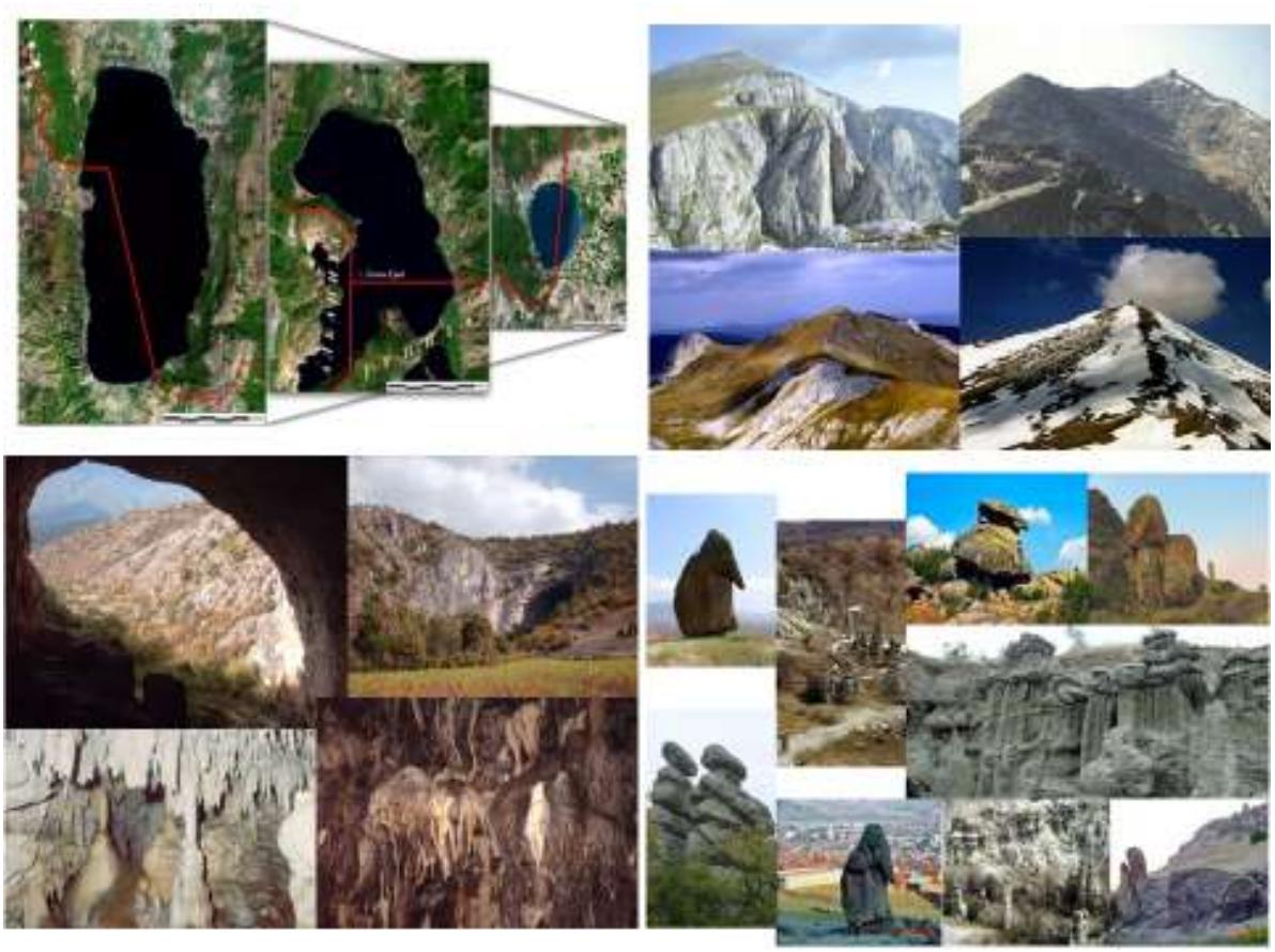
Figures 2. Part of important natural - geographical places and objects in RN Macedonia