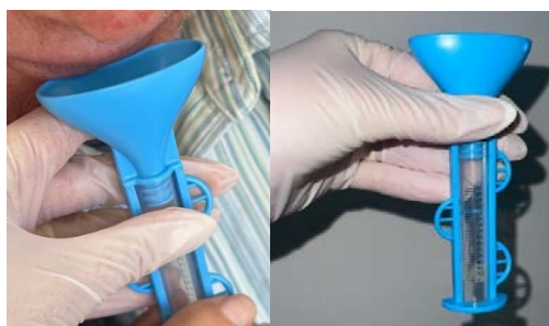
Slika 1. SimplyOFy graduisane epruvete za sabiranje i evidentiranje količine pljuvačke

The test tubes contain an ingredient that provides stabilization of the saliva, placed under the cap and activated by manually shaking the tube for one minute. This process enables the stability of the saliva for even 10 months after its collection. In order for the samples to remain stable and biologically integrated for further biochemical analyses, the samples were frozen at a temperature of -80 degrees Celsius.