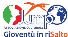
(LEADER) JUMP - Gioventù in riSalto