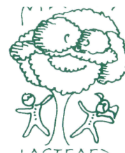
Tallinn Männi kindergarten