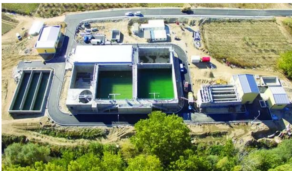
Figure 3: Bird-view of the wastewater treatment plant in Radovich