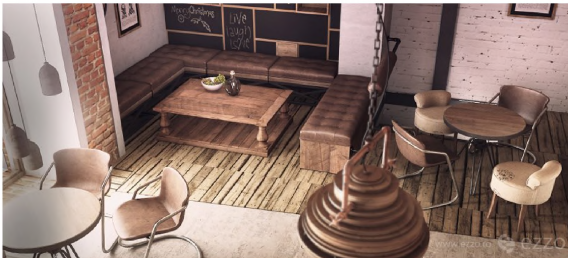
Figure 7. This interior is built in an old tunnel .. Post industrial design itself explains how the designer can turn the chaos into a nice design, significant and functional place.