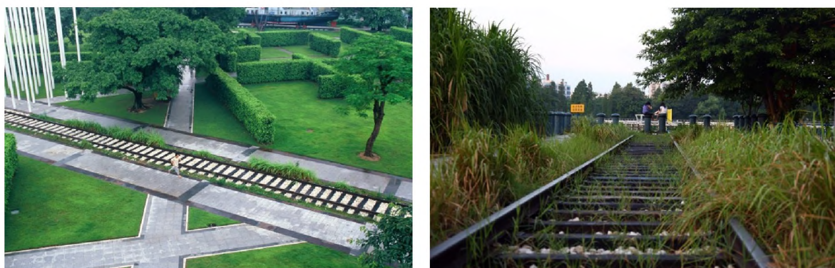
Figure 12. This park is built on an old shipyard. Opinion industrial design itself is explained about how the designer can turn the chaos into a nice design, significant and functional place.

What should make a space look industrial style: