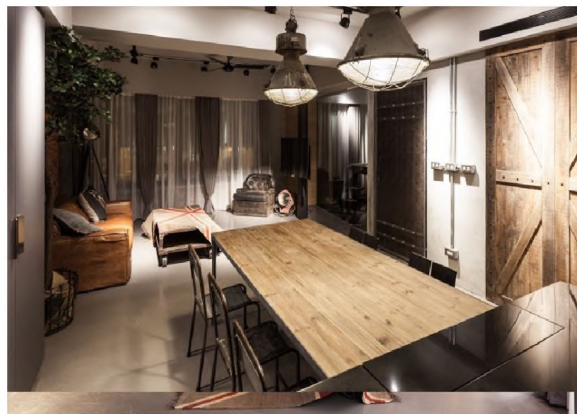
Fig. 2. Exterior post industrial style

Post-industrial style refers to aesthetic trends in design that emphasize sharp lines, sudden connections and dynamic interaction of movement.