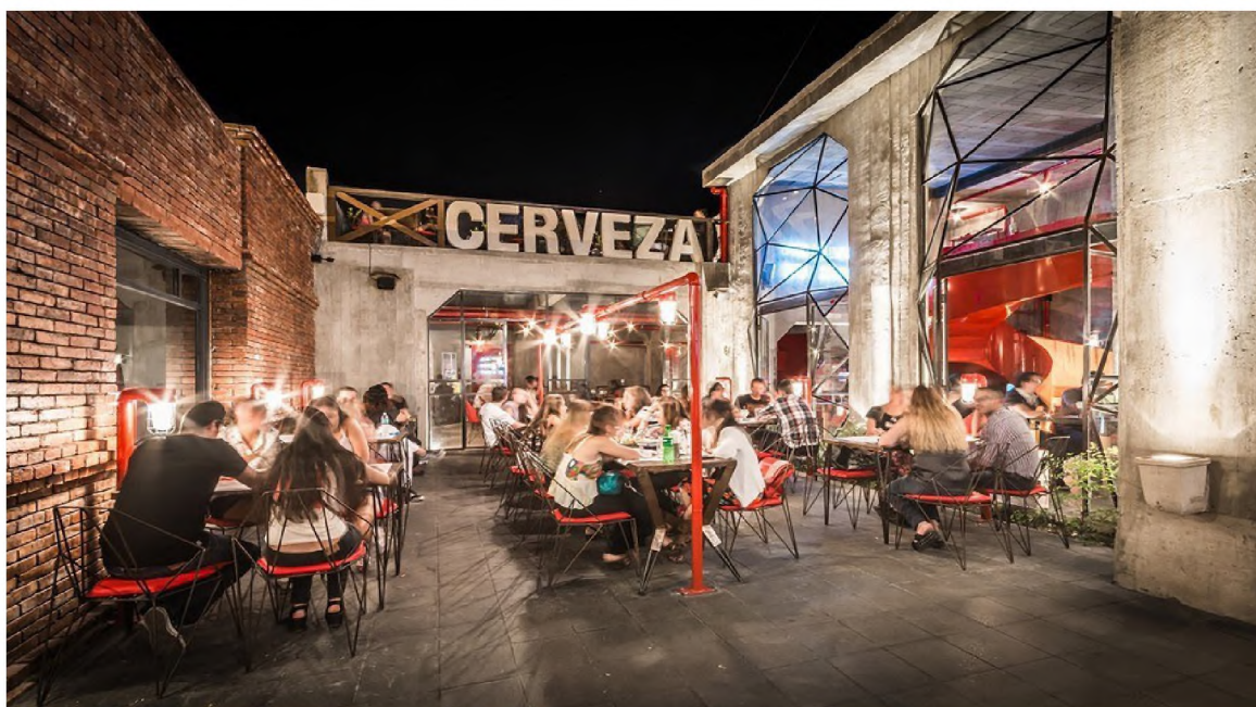
Fig. 8. This interior is built in an old tunnel .. Post industrial design itself explains how the designer can turn the chaos into a nice design, significant and functional place.

With the addition of concrete, iron and glass, the building has a fascinating exterior design that attracts passers-by like a magnet. Exposed red pipes strongly oppose the gray cement, which leads to a joyful and dynamic visual scheme. These tubes distribute lines to various bars and maintain the lighting installation.