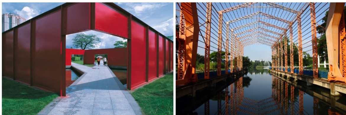
Figure 11. This park is built on an old shipyard. Post industrial design itself is explained about how the designer can turn the chaos into a nice design, significant and functional place ..

This park is ecological, educational, and full of cultural and historical significance. It urges people to pay attention to culture and history, which has not yet been appointed as official or "traditional".