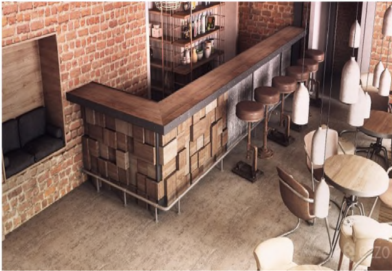
Fig. 3. Industrial wall

If in the past it was not possible space without cover pipes, installation and hidden bricks, today with the growing popularity of post-industrial style more and more modern apartments go to organize the space, leaving them uncoated pipes and walls. The idea that such a space is unfinished is increasingly becoming a thing of the past, and after the industrial style enters not only homes but also commercial and office interiors.