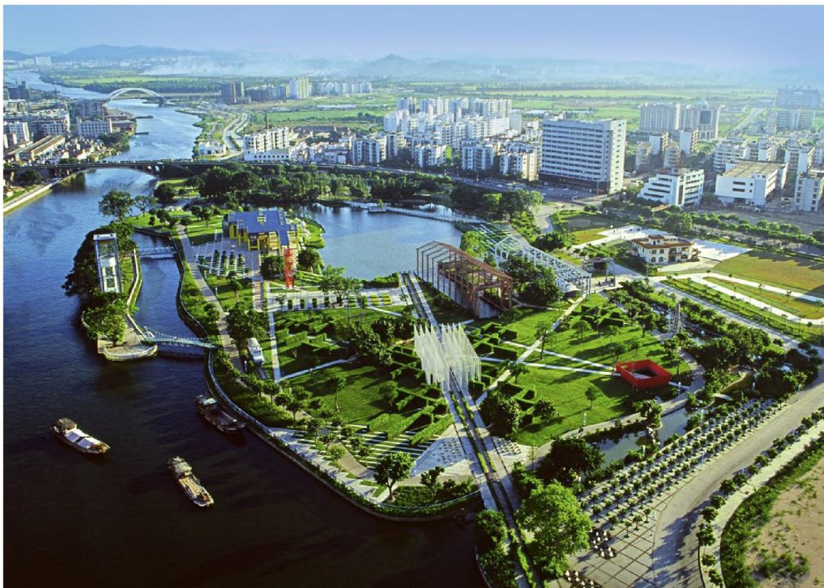
Fig. 10. This park is built on an old shipyard. Post industrial design itself explains how a designer can turn a mess into a nice design, a significant and functional place.

American and European countries have taken the lead in applying environmental thought to the land restoration zone, which has a wide impact and sought after by many designers. Industrial design focuses on returning to the environmental point of view. It can be shared with new communicates with history, as well as allow the past to acquire a rebirth, forming a harmonious and the whole landscape of industrial heritage.