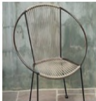
Grape harvesting furniture