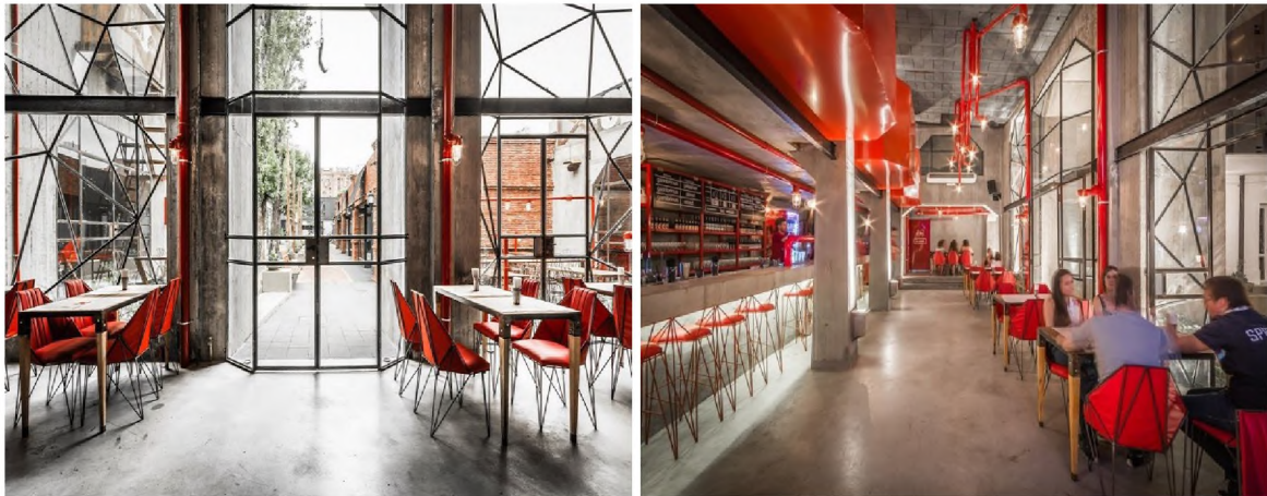
Fig. 9. This interior was built in an old factory (old police station). Post industrial design itself explains how a designer can turn a mess into a nice design, a significant and functional place.