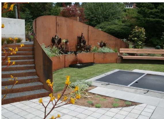
Fig. 1. Interior in post industrial style

The emergence of post-industrial style is in the XXI century, where the dominant positions in architecture are taken technology and functionality, which later became the basis of industrial style. The first attempts at this idea of industrial style appeared in the early 90's. While the industrial style emerged in the 19th century, when factories and old farms were destroyed en masse. Then, with their redemption, people buy them and turn them into their home. Industrial style strives for naturalism in the true sense of the word, which means heavy materials, unsophisticated details, dark colors. This was the only place to work.