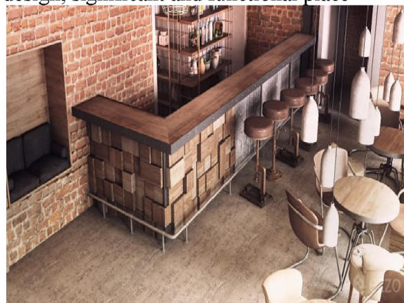
Figure 6. This interior is built in an old tunnel . Post industrial design itself explains how the designer can turn the chaos into a nice design, significant and functional place.