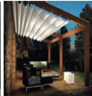
Modern shade structure

Base material: steel, metal, wood, elements may be present, such as exposed beams and pipes, concrete and brick, without decoration. The walls are unfinished or old look, the floor can be stone, concrete or wood. Key elements: natural stone or brick masonry, steel structures. beams and columns, concrete, untreated wood, a combination of matte and glossy metal. When it comes to lighting, metal lamps and chandeliers are the first choice.