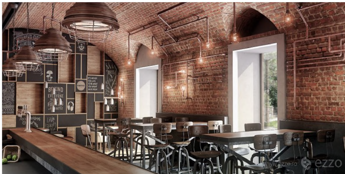
Figure 5. This interior is built in an old tunnel .. Post industrial design itself explains how the designer can turn the chaos into a nice design, significant and functional place