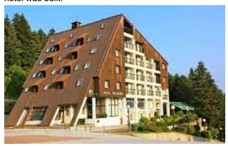
Figure 5. Hotel "Molika"

From 1991 onwards with the transformation of the economy in SR. Macedonia and the denationalization process, the hotel industry in the city is changing significantly. In 1994, on the site of the former mountain lodge, and later the "Begova Cheshma" hotel, the "Molika" hotel was built.