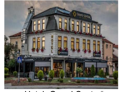
Hotel "Grand Center"