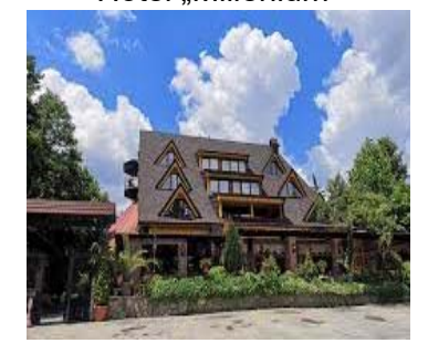
Hotel "Shumski feneri"