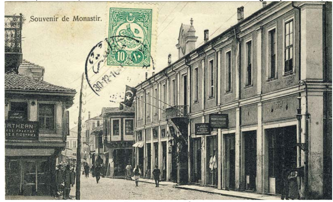
Figure 1. Hotel "Orient"

From the travelogue of Colmar Goltz, from 1893 we learn the name of another hotel in Bitola, Hotel "Beograd". The "Hotel - City of Belgrade" opened its not very hospitable doors to us; however, in the end, it turned out to be more tolerable than we thought." (Matkovski, 2005)