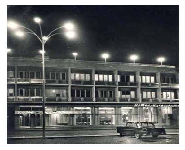
Figure 3. Hotel "Macedonia"

In 1974, the hotel and restaurant "Epinal" was built in Bitola, with 60 rooms and capacity for 440 guests. In Bitola in 1974, there were the following accommodation facilities: Hotel "Macedonia", Hotel "Trudbenik", Hotel "Begova Cheshma", then Children's resort "Pelister", mountain lodge "Kopanki" and mountain lodge "Golemo Ezero".