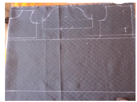
Figure 3: Tailoring the Model 1

The cut image of the top part of the dress is derived from the basic cut of a waist-length children's blouse. The skirt is a straight piece that connects to the upper part in the waist area and has precisely spaced pleats. The contours of the cut are drawn on the material, which is placed half-width and turned face to face. The sleeve of this model has a small fold in the shoulder area and because of this the modeling is done from a basic cut of the sleeve. Drawing is done with tailor's chalk that evaporates when ironing. Tailoring is done by hand with tailoring scissors, leaving seam allowances and pinching the locations of the folds. According to the upper parts - one front and two back parts, the lining is also cut.