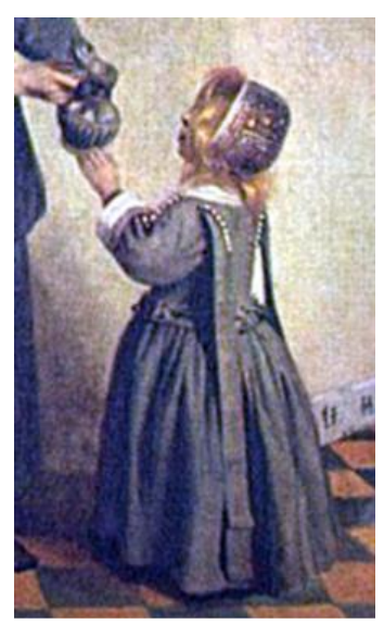
Figure 1: Inspiration for the Model 1