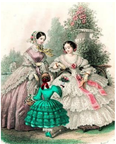
Figure 2: Inspiration for the Model 2

The Victorian period in terms of fashion designs is still very inspiring for many designers today. The inspiration for model 2 came from the idea of using many different materials at that time, especially the use of embroidery. In this model a special detail- a tapestry is sewn on the front of the dress, which, along with the corners, will capture the Victorian line, and in today's time, it will leave an impression of a unique design of a children's dress.