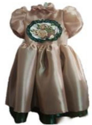
Figure 5: Tailoring the Model 2