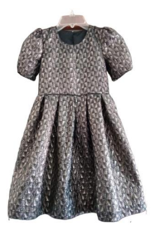
Figure 4: Final appearance of model 1

"Savremeni trendovi i inovacije u tekstilnoj industriji" 14-15. septembar 2023. Beograd, Srbija