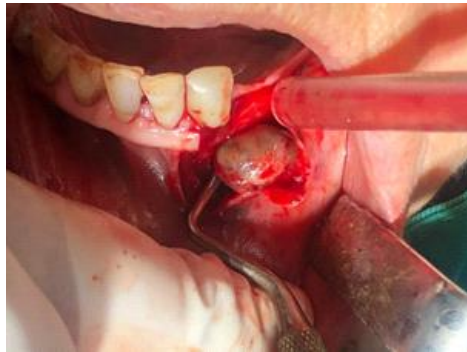
Figure 4. Enucleation of Figure.