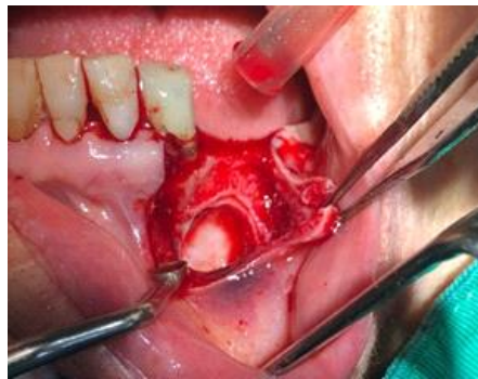
Figure 3. Formation of a mucoperiosteal flap.

for pathohistological examination at the Institute of Pathology for pathohistological verification of the cyst and establishing the diagnosis- Radicular(residual) cyst.