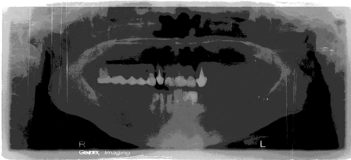
Figure 1. X-ray panoramic image.