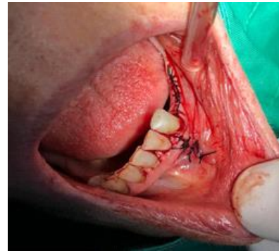
Figure 5. Suture setting cyst.

The staining of the material was by standard histochemical procedure after Hematoxylin Eosin (HE).