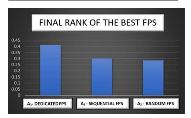
Fig. 3. Final ranking of the best flexible manufacturing system

After the detailed analysis and assessment in this case, the most favorable flexible production system is the third one, that is, a dedicated or specific flexible production system.