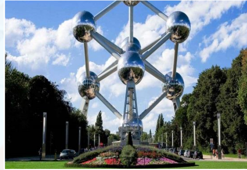
Atomium, Brussels (Belgium)