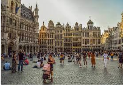
Grand-Place du Bruxelles