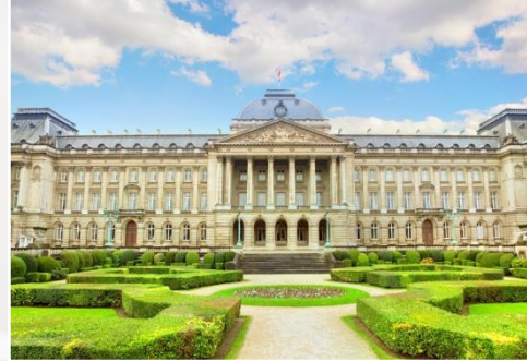
Royal Palace of Brussels