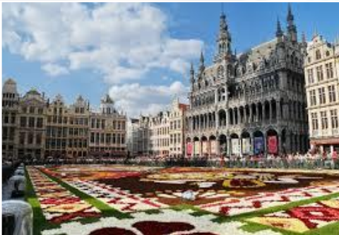
Brussels flower palace