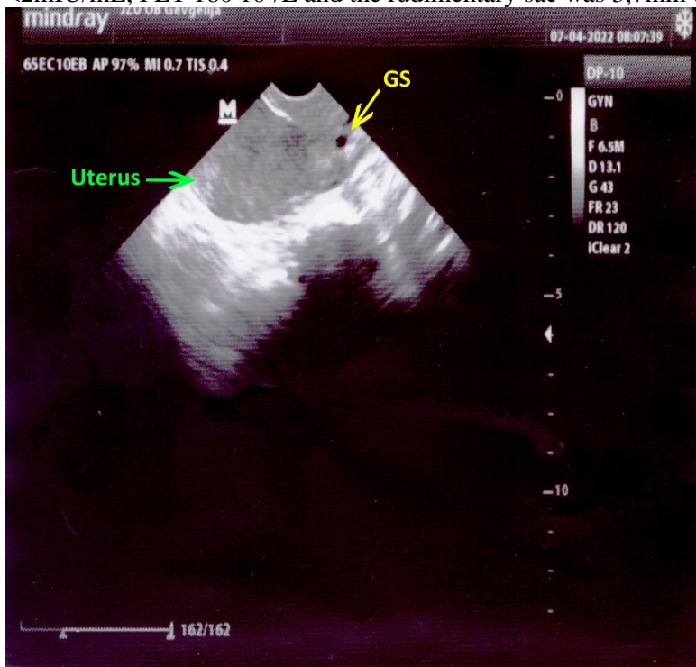
Figure 3. Residual gestational sac (GS) after period

The patient resumed her normal period after 6 weeks and hCG level after the patient's period was <2\text{mIU/mL} , \text{PLT } 180 \cdot 10^9/\text{L} and the rudimentary sac was 3,7mm (Figure 3).