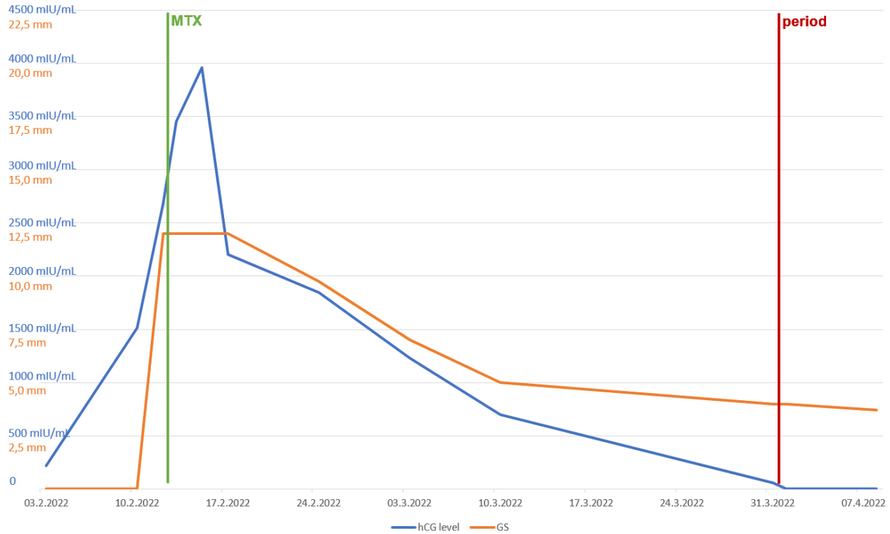
Figure 2. Human chorion gonadotropin (hCG) level and gestational sac (GS) length progression during conservative management of cervical pregnancy with methotrexate (MTX)

The patient resumed her normal period after 6 weeks and hCG level after the patient's period was <2\text{mIU/mL} , \text{PLT } 180 \cdot 10^9/\text{L} and the rudimentary sac was 3,7mm (Figure 3).