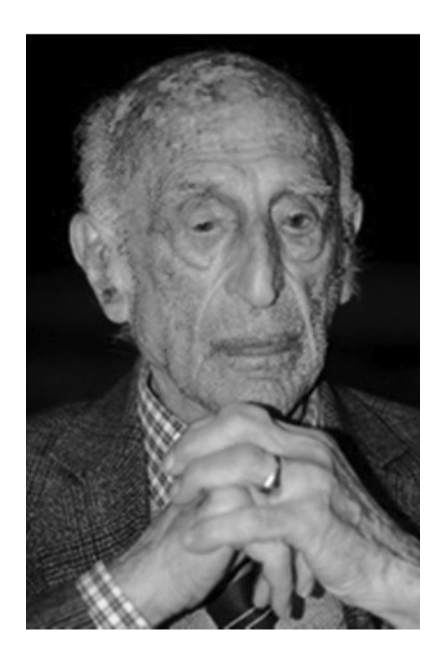
Figure 1: Gillo Dorfles, La moda della moda, 1984: Biography of Gillo Dorfles". Italica.rai.it. Archived from the original on 22 October 2013. Retrieved 12 May 2013.

Gillo Dorfles was born in Trieste in 1910. A painter, he has also written numerous essays on aesthetics. In 1948 he founded the MAC (Movimento Arte Concreta, or Concrete Art Movement) together with Monnet, Soldati and Munari.