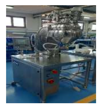
Figure 3. Homogenization mixer of producer OmniProjekt installed in our production site

The qualification process itself was implemented in the following order: