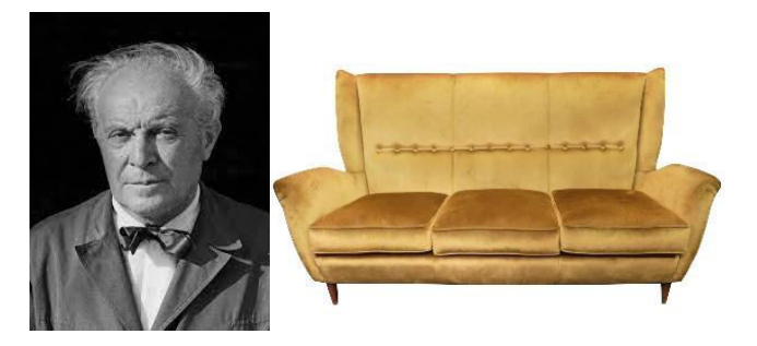
Figure 2. Gio Ponti - An elegant sofa designed by Gio Ponti, manufactured by ISA, Italy in the 1950s, in gold Dedar fabric.