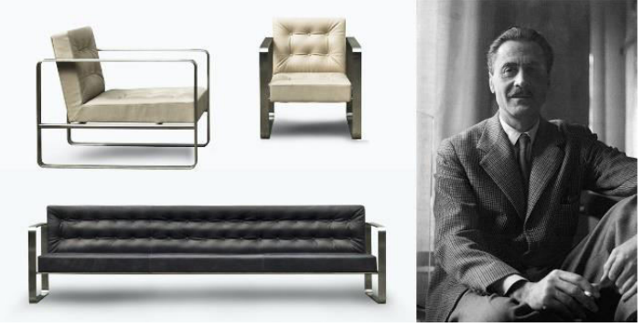
Figure 1. Franco Albini – sofa from series T33

Italian design, as a leading home style, places the greatest emphasis on furniture and interior design, unlike all other types of design. Italy can boast of a large number of artists who have allowed the country to be one of the best and most highly developed in the field of design. The focus of designing is placed exactly on the furniture for the home style, or rather the designers were concentrated on designing furniture for interior interiors. The most recognizable are the large comfortable sofas and chairs that are widely used in the home. Some of the most famous Italian designers are Franco Albini, Gio Ponti, Carlo Imonino, Giorgio Grassi, Aldo Rossi, Vittorio Ducrot and Ernesto Basile Dulio Ciambellotti, Ernesto Basile and the Bugatti brothers, Franco Albini, Ignazio Gardella, Luigi Caccia Dominioni, Vico Magistretti, Ettore Sottsas, Marco Zanusso, Achille and Pergiacomo Castiglioni and the BBPR Group (Banfi, Belgiozoso, Peresuti, Rogers), Mario Bellini, Vico Magistriti, Gae Aulenti, Angelo Mangirotti, Enzo Mari, Rodolfo Bonetto, Marco Zanusso and others (Figure 1 and 2) [4,5].