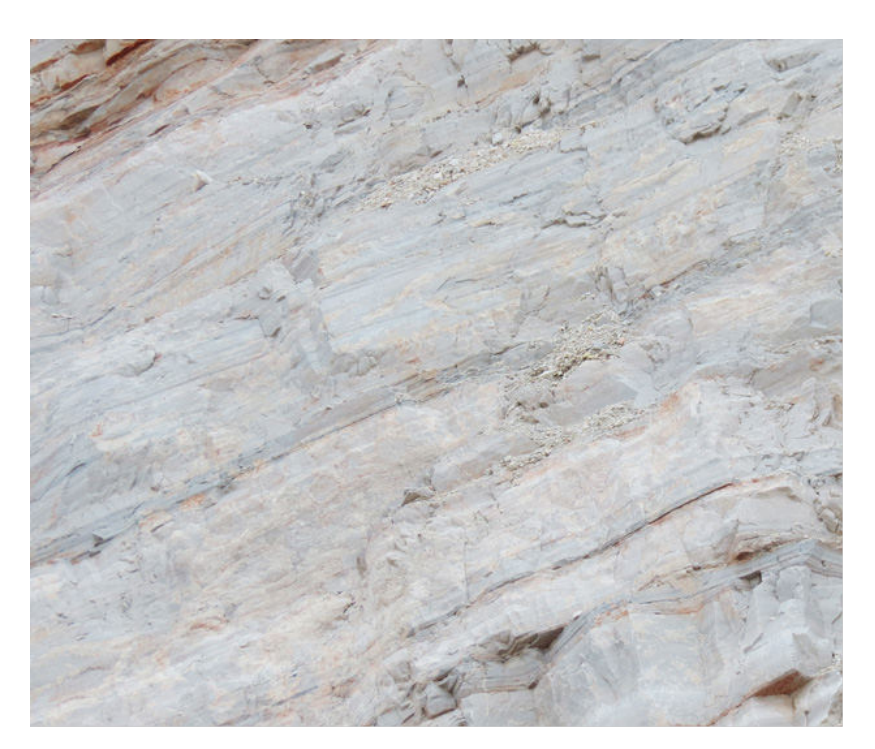
Figure 2. White dolomite marble from the locality Pletvar

From a mineralogical aspect, these are carbonate rocks made mostly of dolomite. Calcite is not very present – that is sample II/6. Dolomite crystals are mostly present in irregular to hypidiomorphic form and are slightly extended in the direction of the orientation of the rock. The extension of the crystals is more strongly pointed in sample II-5 (light grey dolomite marble). Average granulation of the dolomite crystals is from 45-65 microns seen in all samples. Microcavities are noticed in the sample marked II/8 but are very rare, while microcavities are also visible in sample II/2.