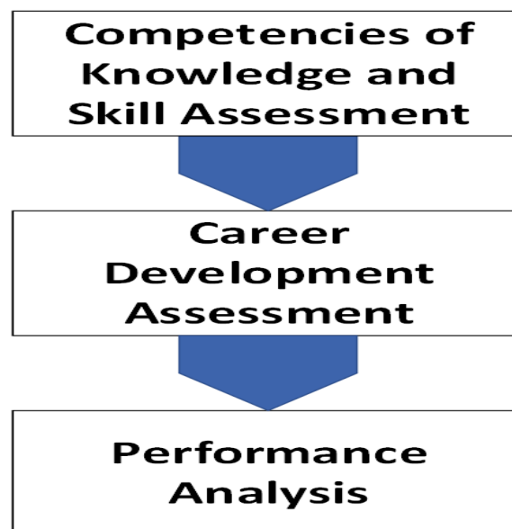
Figure 2. Elements for Identification of Training Needs Assessment in Education.

There are few crucial elements that are part of the activities for identification of training needs assessment in education, such as: competencies of knowledge and skill assessment, career development assessment and performance analysis [18-19], [22-23]. These elements help them to increase the knowledge, skills and the abilities in the educational process and to be successful in the practical exercises.