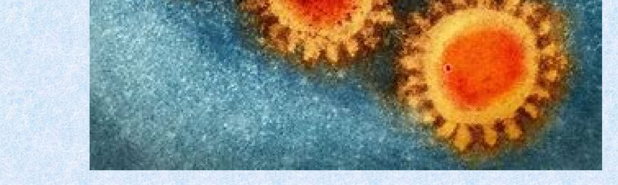
Figure 1: View of SARS-CoV-19

Conclusion: In pandemic period of SARS-CoV-19, dental patients are divided into three groups of: A) healthy, B) suspected to SARS-CoV-19 and C) confirmed for SARS-CoV-19. The risk of infection transmission is high, so there is a need for separate waiting room and dental office room. All groups should have the same and equal health and dental treat, but with high dose of caution, for B) and C) group especially C) group. This protocol can be use in similar pandemic periods in the future. Keywords: dental care, SARS- CoV-19, pandemic period,