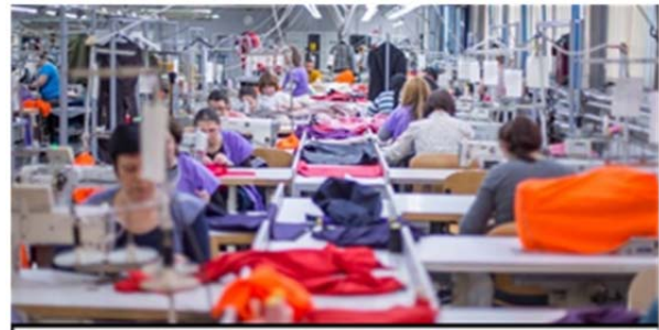
Figure 2. Sewing unit in a modern Macedonian production plant

Modernly built and modernly arranged production plants, divided into units according to the production flow include: warehouse, tailoring unit, sewing unit, ironing unit, unit for finishing processes, packaging unit and unit for finished products and their preparation for export. Depending on their function, the units are equipped with state-of-the-art filters for cleaning the textile dust, air conditioners for regulating temperature and air, as well as monitors for monitoring the production process, which is shown in Figure 2.