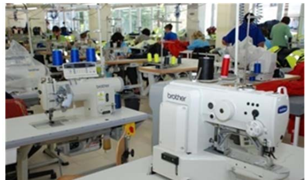
Figure 3. Part of the machine fleet in a Macedonian garment facility

The machine fleet is in accordance with the requirements and needs of the client, such as types of machines for making appropriate items, auxiliary machines, tailoring machines, embroidery machines, ironing machines, etc., which is shown in Figure 3.