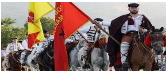
Figure 11. Picture from the Manifestation Ten Days of the Krushevo Republic.