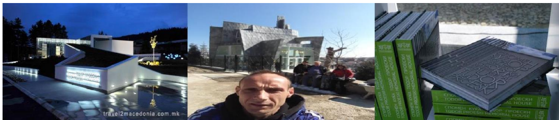
Figure 10. Memorial house, tomb and monograph on Tose Proeski