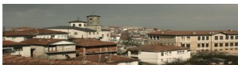
Picture 4. Church “St. Mother of God”.