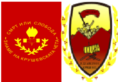
Figure 1. Flag and coat of arms of the municipality of Krushevo.