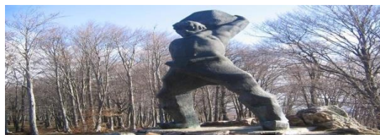
Figure 8. The monument of the fallen fighters on Meckin Kamen, (Source: www.trekearth.com-779x584 ).

It is located near the city of Krushevo and is recognizable by one of the most difficult battles fought for the defense of the Krushevo Republic. Duke Pitu Guli and his comrades died bravely in it. They heroically remained to fight to the end against the very thousand Turkish army led by Bakhtiar Pasha.