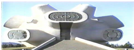
Figure 7. Monument "Ilinden" (Macedonia), (Source: nt.krusevo.org-480x360 ).

It is a symbol of the disobedience of our people, as well as a desire, but also an aspiration for a free and independent Macedonia. It is located at an altitude of 1320 meters and an area of 12 hectares. In the dome is the tomb of Nikola Karev and the bust of Tose Proeski. The view is beautiful and has always attracted visitors.