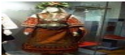
Figure 12. Women's costume

The event is held every year from July 19 to August 10. There are several ethno-style events (concerts, tastings of specialties, exhibitions, etc.). During this event, residents dress as comites, chorbadzi or in Turkish military uniforms in order to bring closer the image of 1903.