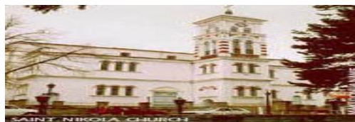
Picture 3. Church “St. Nikola ”in the city of Krushevo, (Source: www.trekearth.com-800x631 ).

It was built in the period from 1905 to 1907, on the site of the previous church that was built in 1832, and also dedicated to St. Nicholas. During the Ilinden Uprising 1903 it was completely burned and destroyed. In it was the most beautiful iconostasis, which was made by the woodcarvers for twenty years. It abounds in numerous icons that have great cultural - artistic value. In addition to the external appearance, the public fountain is very attractive for the visitors, which captivates all the visitors with its cold water.