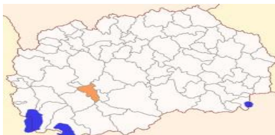
Map 1. Geographical position of the municipality of Krushevo in RS Macedonia. ( https://mk.wikipedia.org/wiki/Municipality_Krushevo. )

Within the Municipality, the city of Krushevo covers an area of 190.68 km 2 , and is located at (1350 m), while the whole area, north and northwest of Krushevo, extends at an altitude of 1500 to 1700 m., The city has a central location and is an administrative, economic and cultural center. Its neighboring municipalities are Krivogashtani and Dolneni to the east, Makedonski Brod and Plasnica to the north, Drugovo to the west, Demir Hisar to the southwest and Mogila to the south. The territory of the municipality has an area of 205 km 2 , which represents 0.8% of the total territory of RN Macedonia.