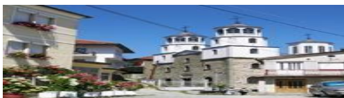
Picture 5. Church “St. Jovan”, (Source: www.travel2macedonia.com.mk-375x500 ).

It is located in the center of the city of Krushevo near the bazaar. It is also known as the Wallachian Church. It abounds in icons made by Krushevo painters. At the very entrance of the church there are icons from 1627 which are transferred from the church "St. Atanasie " and is a rarity, due to the construction of the muddy foundation.