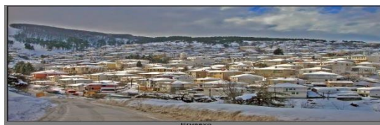
Figure 2. View of the city of Krushevo in winter idyll, (Source: www.trekearth.com-800x631 )

The average annual cloud cover is 5.3 tenths, with a maximum of 6.5 tenths in December and January, and a minimum of 3.2 tenths in August.