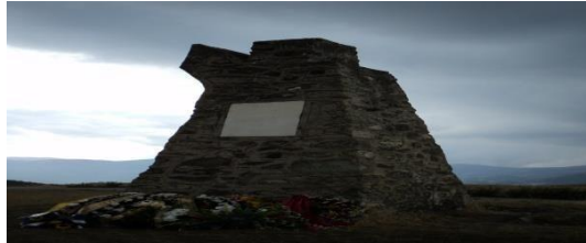
Figure 9. Monument of the locality "Plum", (Source: www.commonswikimedia.org ).

It is located about 5 km from Krushevo, ie "Sliva" is the highest point at the exit from Krushevo to Kicevo. It is located at an altitude of 1357 meters between two high hills. On August 12, 1903, a bloody battle was fought led by Dukes Dime Smugrev and Gjorgji Stojanov, who were trying to keep the Turkish army to save the main headquarters of the Krushevo Republic and the entire population. They were dug in the trenches and had a huge view of the enemy, thanks to the altitude.