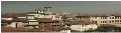
Picture 4. Church "St. Mother of God ", (Source: www.panoramio.com-500x283 ).

It is the oldest preserved church and is the largest in Krushevo. It is made of processed stone, has two entrances, numerous icons, one of which is from 1869. According to the external and internal appearance, it is a very important cultural-historical monument and an important tourist object.