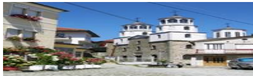
Picture 5. Church "St. Jovan ", (Source: www.travel2macedonia.com.mk-375x500 ).

It is located in the center of the city of Krushevo near the bazaar. It is also known as the Wallachian Church. It abounds in icons made by Krushevo painters. At the very entrance of the church there are icons from 1627 which are transferred from the church "St. Atanasie "and is a rarity, due to the construction of the muddy foundation.