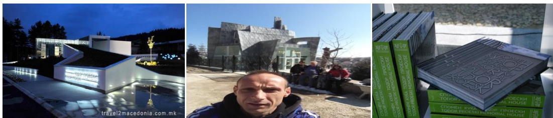
Figure 10. Memorial house, tomb and monograph on Tose Proeski