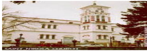
Picture 3. Church "St. Nikola "in the city of Krushevo, (Source: www.trekearth.com-800x631 ).

and destroyed. In it was the most beautiful iconostasis, which was made by the woodcarvers for twenty years. It abounds in numerous icons that have great cultural - artistic value. In addition to the external appearance, the public fountain is very attractive for the visitors, which captivates all the visitors with its cold water.