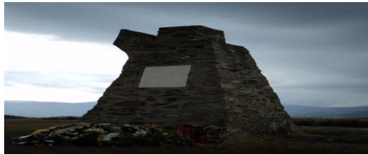
Figure 9. Monument of the locality "Plum", (Source: www.commonswikimedia.org ).

It is located about 5 km from Krushevo, ie "Sliva" is the highest point at the exit from Krushevo to Kicevo. It is located at an altitude of 1357 meters between two high hills. On August 12, 1903, a bloody battle was fought led by Dukes Dime Smugrev and Gjorgji Stojanov, who were trying to keep the Turkish army to save the main headquarters of the Krushevo Republic and the entire population. They were dug in the trenches and had a huge view of the enemy, thanks to the altitude.