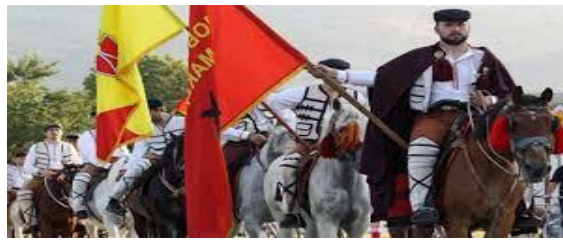
Figure 11. Picture from the Manifestation Ten Days of the Krushevo Republic.

Since 1966, every year from August 1-10, the manifestation "Ten Days of the Krushevo Republic" is held. It starts with a simulation of the insurgents' struggle for the liberation of Krushevo from Turkish slavery, and ends with the laying of fresh flowers at the Meckin Kamen site.