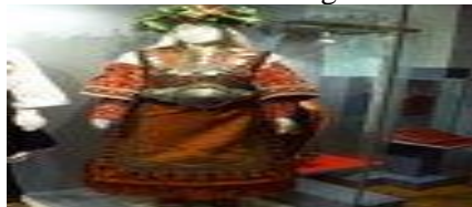
Figure 12. Women's costume

The event is held every year from July 19 to August 10. There are several ethno-style events (concerts, tastings of specialties, exhibitions, etc.). During this event, residents dress as comites, chorbadzi or in Turkish military uniforms in order to bring closer the image of 1903.