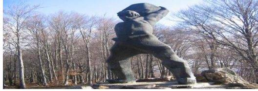
Figure 8. The monument of the fallen fighters on Meckin Kamen, (Source: www.trekearth.com-779x584 ).

It is located near the city of Krushevo and is recognizable by one of the most difficult battles fought for the defense of the Krushevo Republic. Duke Pitu Guli and his comrades died bravely in it. They heroically remained to fight to the end against the very thousand Turkish army led by Bakhtiar Pasha.