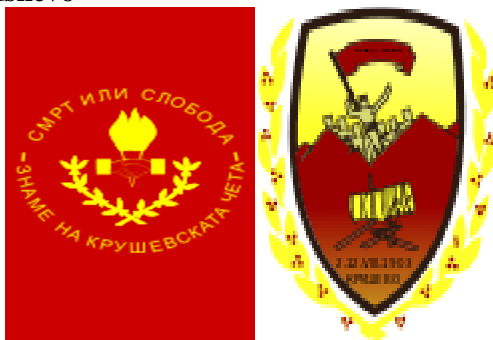
Figure 1. Flag and coat of arms of the municipality of Krushevo.