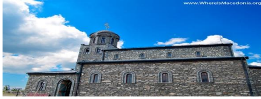
Picture 6. Monastery "St. Transfiguration"