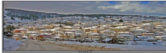
Figure 2. View of the city of Krushevo in winter idyll, (Source: www.trekearth.com-800x631 )

movements and stays. The average annual rainfall is 815.0 mm, with a maximum in November of 102.1 mm and a minimum in July and August of 39.8 mm. The most rainy seasons are autumn (246.0 mm), followed by spring (217.9 mm), winter (210.5 mm) and summer (140.6 mm). Rainfall is from rain, but also from snow. Snowfall has a positive effect on tourists, especially the snow cover. For the realization of the ski activities, a minimum height of the snow cover of 15 cm is necessary. In the climate across the established appeared on the snow in September, but also in May. The average date of the first snow is 6.XI., and of the last 21.IV. The earliest date is 22.IX, and the lowest date of snowfall is 28.V.