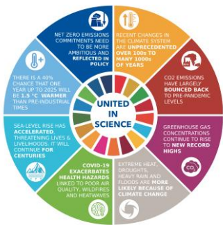
Fig. 2. Climate changes and impact accelerate

The trend called Cannabis-Wine requires a thorough and in-depth investigation, and an explanation needs to be given.