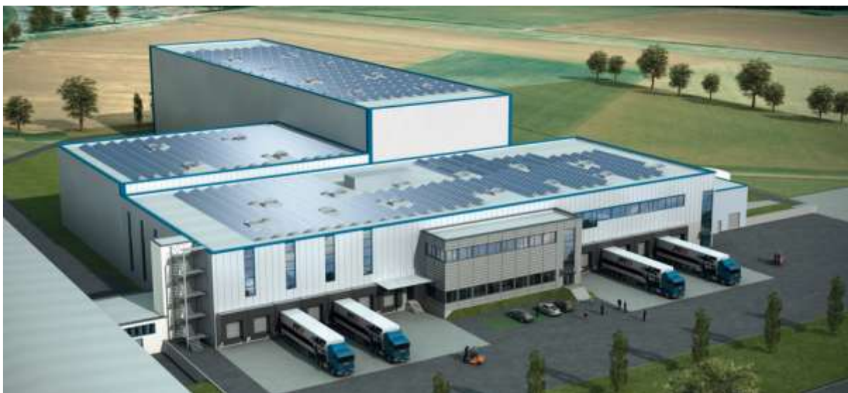
Figure 1 Logistic center (Auto-Teile-Pöllath Handels GmbH)

Below is a picture of a modern logistics center where car manufacturing elements are stored.