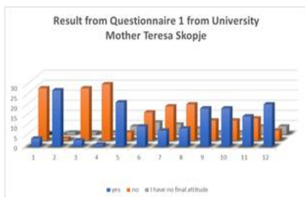
Figure 2. Results from MT

Now we will show the results from University Mother Teresa - Skopje. The results for Questionnaire1 from University Mother Teresa Skopje are given in Fig.2.