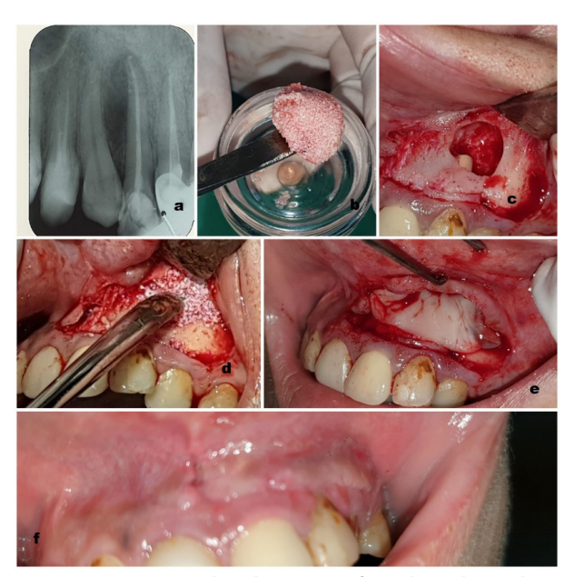
Figure 6. a) Retro alveolar X-Ray of tooth 22, b) Sticky bone, c) Bone defect after enucleation of the radicular cyst and resection of the tooth apex, d) Done cavity filled with sticky bone, e) Sticky bone covered with PRF membrane, f) Post-operative status after two weeks

In the figure 7 is shown case of preservation of the extraction sockets and augmentation of alveolar ridge in the maxilla in region of tooth's 14, 15 and 17. After extraction of the teeth, mucoperiosteal flap was done. Extraction sockets were fulfilled with sticky bone, which was covered with Bio-Oss collagen membrane and above all that PRF membrane was lay on. The flap was repositioned to its presurgical level and sutured with atraumatic silk string. Clinical healing was normal with neither inflammation nor untoward clinical symptoms. Postoperative clinical parameters showed that application of PRF achieved formation of new bone tissue and enough keratinized gingiva. It was therefore natural to capture whole volume of monocytes in the PRF, to make it more active in stimulating bone grafts, but also to turn to a more rapid transformation of monocytes into macrophages to increase the effect bone stimulation.