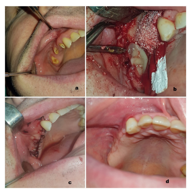
Figure 7. Preservation of the extraction wound and augmentation of alveolar ridge: a) Status intraorally, radix gangrenosa 14, 15, 17, b) Applied sticky bone covered with Bio-Oss Collagen membrane and PRF membrane, c) Set suture, d) Post-operative status after 3 weeks

In figure 8 was presented a case where bony defect was consequence of wearing fix orthodontic bracelets. X-ray revealed lack of bone around the roots of first and second maxillary incisors. Incision was made corresponding to the number of adjacent one defect, extending to the line angles of both adjacent teeth that had no defect. Sticky bone made of spongious bone substitute and PRF exudate was applied in the bony defect and above that PRF membrane was lie on. Then, the mucogingival flap was repositioned as coronally as possible without tension with 6-0 nylon sutures. Patient was advised to abstain from brushing and flossing around the surgical area until suture removal (14 days after surgery). Control X-ray after 2 mounts showed formation of new bone tissue.