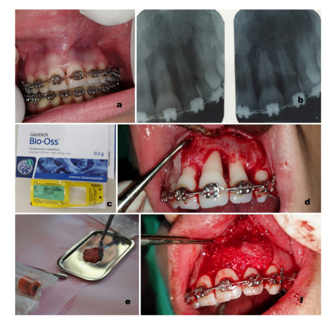
Figure 8. a) Bony defect due to fix orthodontic bracelets, b) X-Ray before and after surgical intervention, c) Bone grafted material and suture used in intervention, d) Absence of the bone around the roots of first and second maxillary incisors, e) Made sticky bone, f) Applied sticky bone in the defect

In our study we used PRF plugs in the sockets of extracted maxillary roots and oral cavity after removal of periapical lesion of tooth 22. With the use of PRF as a socket preservation material in our cases we confirmed that PRF enhances healing of soft and hard tissue and reduced postoperative complications. Our results are in correspondence with Sharma at all. , and Moraschini and Barboza, [19, 20].