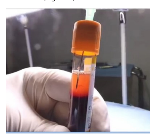
Figure 4. Aspiration of I-PRF

The centrifuge must be set at 7 x 100 rpm/3 minutes. At the end of the spin, supernatant was formed on the surface of the orange tube. In order to collect the liquid, we penetrated the cap with a 21G needle (green) mounted on a syringe. Needle was placed in the middle of the I-PRF supernatant, against the wall of the tube for better visibility. Aspiration was done until the level of the red blood cells raises up to the needle bevel. I-PRF remained liquid for about 10-12 minutes, then clotted. The injection was done before the end of these 10 - 12 minutes (Figure 4).