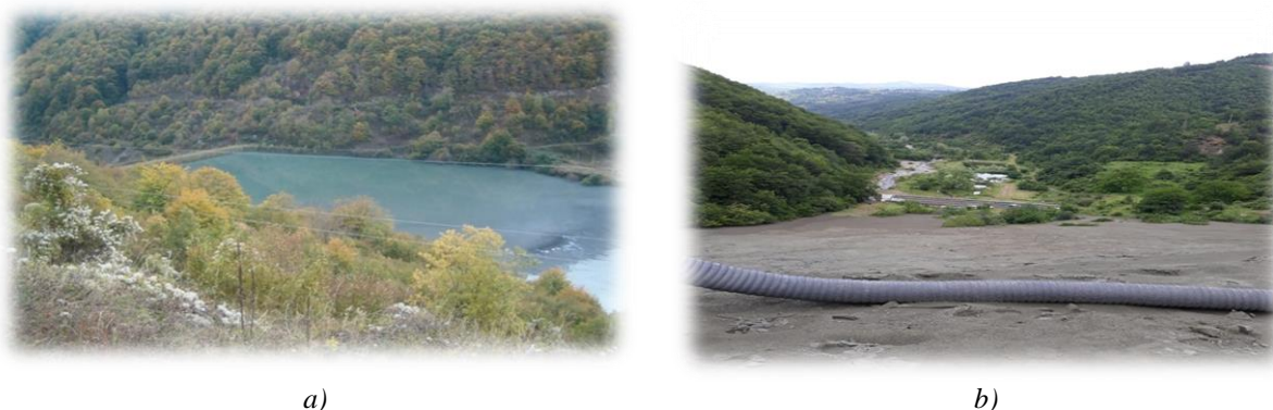
Fig. 5. The position of the Toranica mine tailing dam with the water mirror (a) and view from the tailing dam along the Kriva River valley (b)

The Toranica mine is located roughly 18 km south-east of the town of Kriva Palanka (northeastern part of the Republic North Macedonia) and 2 km west of the Bulgarian border. The mine started commercial production in 1987 (at its peak it accounted for ~20% of Macedonia's total Pb-Zn output). There are elevated concentrations of Cd, Cu, Mn, Ag, and Bi in the ore, also (Serafimovski et al. 1997). Milling and flotation, for the production of Pb and Zn concentrates, are situated close to the mine and there is a tailings dam below the mine site with a culvert directing the River Toranica beneath the dam (Figure 5).