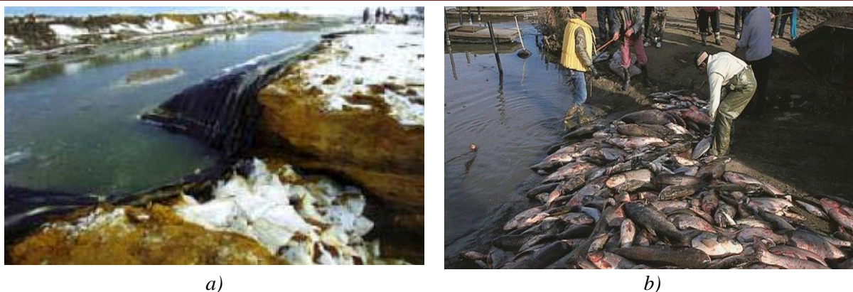
Fig. 2. Illustration of the failed gold-tailing dam in Baia Mare, Romania (a) and illustration of negative influence after the spill of cyanide flow through the Tisza river with dead fish.

The contaminated spill travelled into the rivers Sasa, Lapus, Somes, Tisza and Danube before reaching the Black Sea about four weeks later. Some 2,000 kilometres of the Danube's water catchment area were affected by the spill. Romanian sources said that, in Romania, the spill caused interruptions to the water supply of 24 municipalities, and costs to sanitation plants and industries, because of interruptions in their production processes. Romania also reported that the amount of dead fish was very small in Romania. Hungary estimated the amount of dead fish in Hungary at 1,240 tonnes. Yugoslavian authorities reported large amounts of dead fish in the Yugoslavian branch of the Tisza River and no major fish kills in the Danube River.