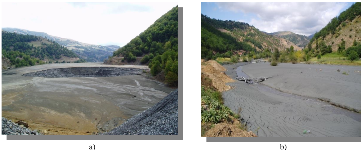
Fig. 3. Illustration of the collapsed "crater" in the tailings dam at the Sasa Mine, Republic North Macedonia (a) and tailing flow contaminates Kamenicka River and its valley, view from valley level (b)

The active production of lead-zinc ore from the Sasa mine that began with active exploitation in 1962 and has been operating to date has enabled the formation of tailings dump in which approximately 18-18.5 Mt of tailings has been accumulated. On the 30. 08. 2003 during the afternoon hours one part of the the Sasa Mine tailings dam collapsed, discharging 70 000 - 100 000 m 3 of material along the Kamenicka River valley (Figure 3).