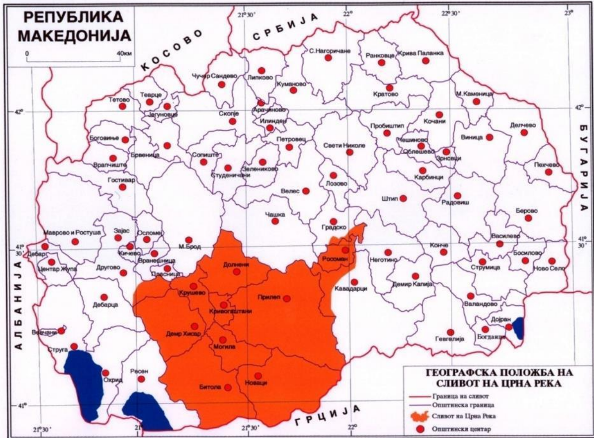
Map 1. Geographical position of the Black River Basin in the Republic of Northern Macedonia