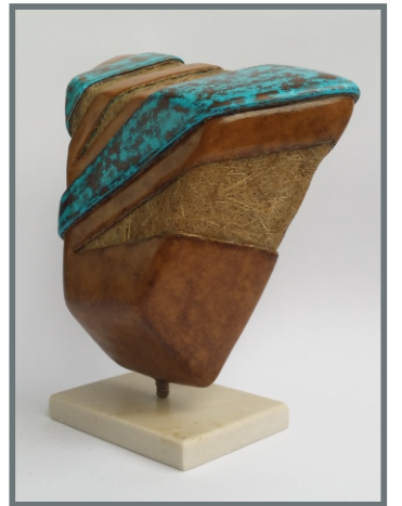
"Severed memories" 25x24x12cm.