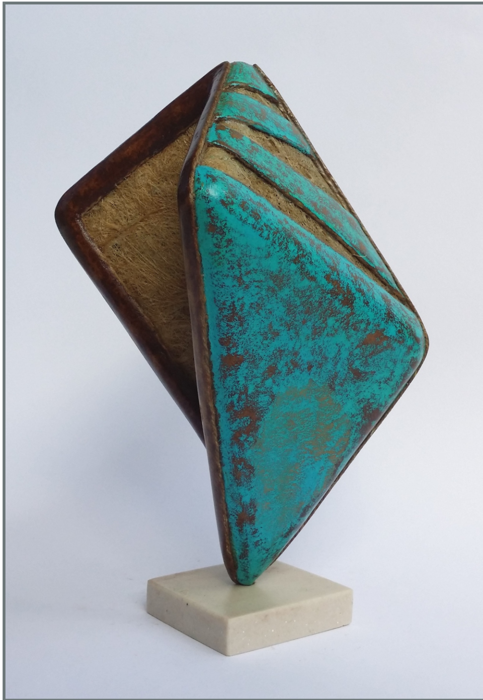
"Venture agreement" 24x13x13cm.