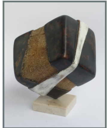
“Closed extension field” 16x16x12cm.