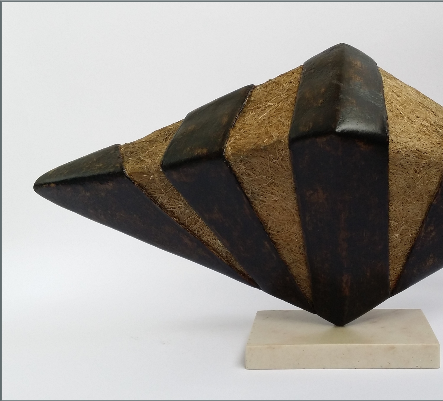
"Morphological disaggregation" 20x40x16cm.