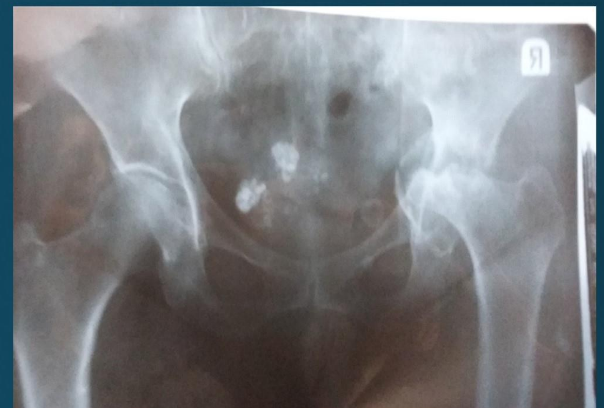
X ray pelvis

67 years old patient who complains of severe pain in the both arms, lower back pain and difficult movement with an orthopedic device. According to functional studies, movement in the hip bone (os coxae) is limited, especially in abduction and internal rotation and also limited movements in the lumbar region of the spinal column. Pseudolaseque is + on 30° bilaterally. The kyphosis and scoliosis of the thoracic spine are also expressed. Expressed muscular hypotrophy of the two lower extremities. Mediincludescament and non medicament therapy (which preformed physical factors and funds) are assigned.