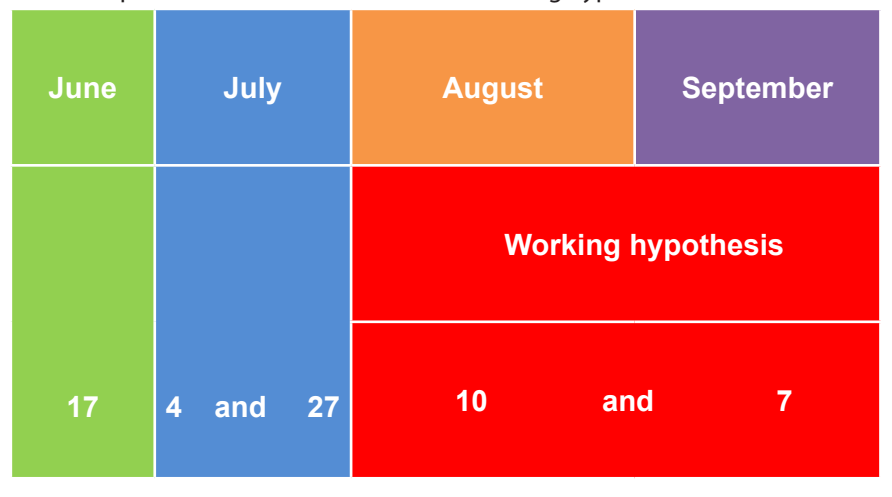
Table 5. Schematic presentation of treatments and working hypothesis.