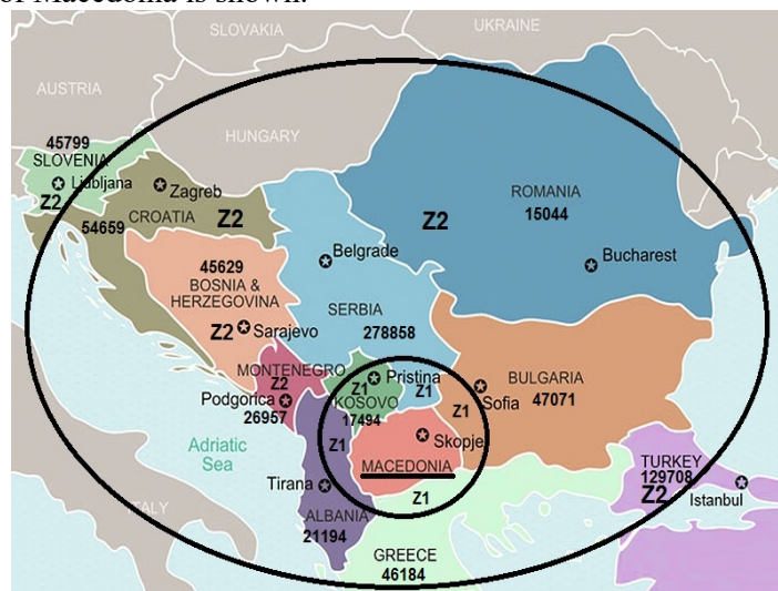
Map 1. Balkan states, divided into two zones and their maximum number of tourists who visited Macedonia

The Map 1 shows all Balkan countries with the maximum number of tourists who have stayed in the Republic of Macedonia, and in Table 7 the maximum and minimum number of tourists from the Balkan countries that stayed in the Republic of Macedonia is shown.