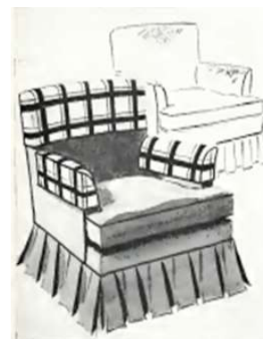
Figure 3. Furniture