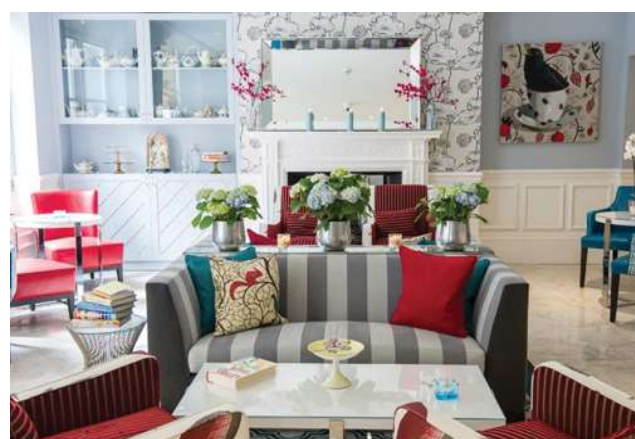
Figure 2. Modern interior

We all know that color can affect the visual definition of the spatial perspective. Cold or receding shades visually increase the distance. While the warm tones stand out, space is folded into visual perception. Through the fabric we create the desired atmosphere