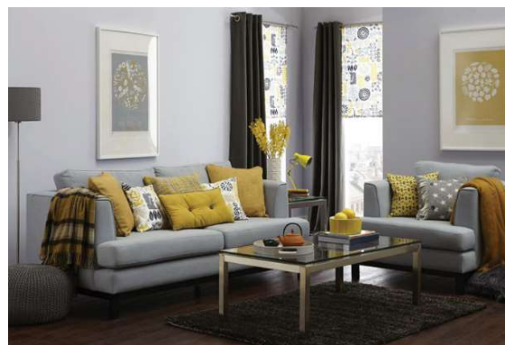
Figure 4. Curtains as an accent

The choice of curtains for the glasses is to take into account such factors as the teaching of light. If the windows with a south view, and all day long, the sun-burning boughs are filled with flocks of linen curtains, and they will be tougher, especially in the bedroom. Flat curtains, if necessary, you can close and create darkness in the flock. In this case, if the flock is directed to the north side, then it is not necessary, because the sunlight penetrates not as active. The curtains, with the exclusion of aesthetics, carry functional loading, preventing water from the water sprays - a very aggressive environment, which can negatively affect the surrounding environment.