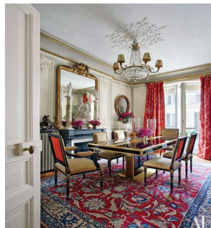
Figure 1. Textile decorative parts

day-to-day life is on the same level as weight and the right choice of furniture.