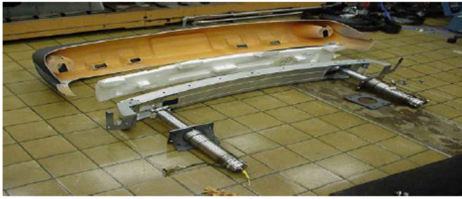
Figure 1: The main components that constitute the bumper system and their relation [2]

The leading restricting constructive factor for the bumper system regarding the construction of the entire vehicle is its volume. The bumper cover for the most part has a design function while its function regarding the vehicle's safety is minor. Because of that, and in order to achieve low production costs, this element at today's modern vehicles is only fabricated out of plastic: polystyrene, polycarbonate or acrylonitrile butadiene styrene. The carrier is the most significant element of the bumper system which protects the vehicle against frontal impacts and rear impacts. The carrier is manufactured out of steel sheet, aluminum, fiberglass, composite material or plastic. Commonly, an element which absorbs the energy from the crash is set between the carrier and the cover. Unlike the carriers, the absorbers are made out of low density materials. The bumper system is attached to the shell of the vehicles via holders through a rigid frame or via elastic framework as the newer constructive solutions suggest, using special mechanisms so-called shock absorbers, which have additional meaning, to absorb a part of the kinetic energy of the crash.