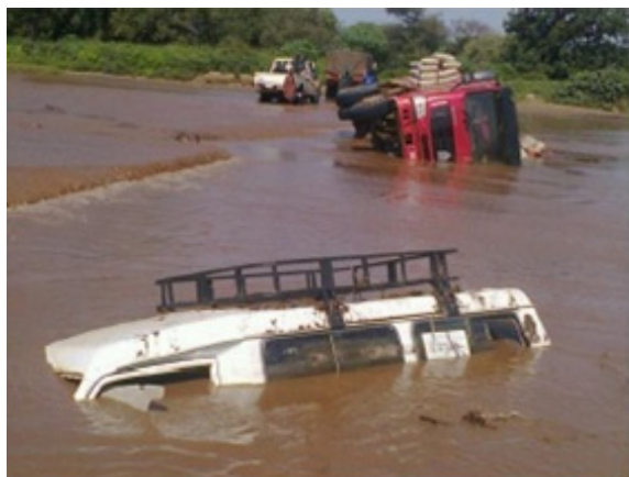
Fig. 1 The rainy season in South Sudan.