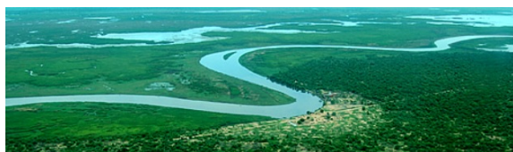
Fig. 2 Forests of South Sudan [6].

potable water resources are very fragile with some areas containing brackish groundwater, limited success with borehole sitting and drilling in some areas, and some boreholes drying up at certain times of year [5]. South Sudan's water primarily comes from underground, from drilled boreholes. The water supply from some wells and boreholes is intermittent, as the water table drops during the dry season, and in fact, many people do not have access to any potable water at all.