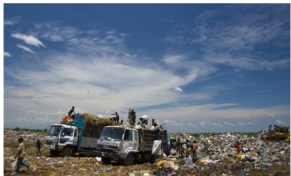
Fig. 3 Location of the Juba Lagoon Dump Site [23].

Waste pickers at the Yei Road site extract plastic, aluminium and other valuable materials for sale [24]. In December 2012, there were an estimated 300 such informal waste pickers collecting an estimated 6 tons of recyclables daily, from the Yei Road dumpsite’s total daily waste collection of 20 tons. None of the informal