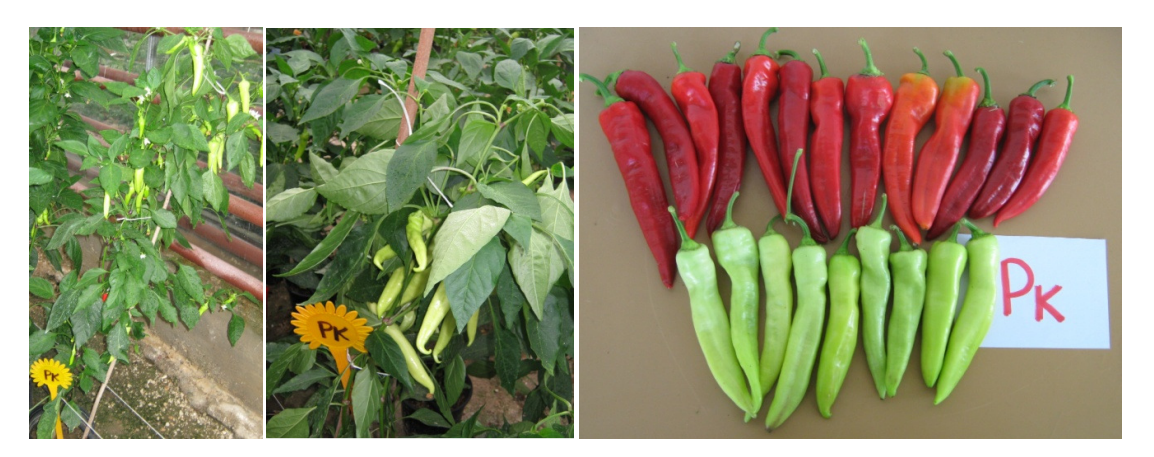
Fig. 1. Plants and fruits of variety Piran used as control genotype in the experiment

The mean internode length of studied genotypes has not shown statistically significant difference. Longer internodes were measured during the first two experimental years as compared to internode length in the third and the forth experimental year. Many plants, including pepper, have internodes length which is determined by day-night temperature variations, which is mainly due to increased cell elongation than due to increasing of cell number. Peppers have shorter internodes when difference between day and night temperatures is smaller Morphological characterization of anther [23]. derived plants in minipaprika showed variation in leaf size, petiole and internode length, flower bud size, nodal color, leaf color, and leaf shape of diploid lines of each minipaprika. As expected, the researchers recorded reduced plant height, leaf size and internodes for haploid regenerants [21,24].