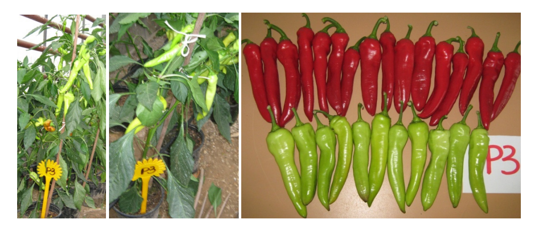
Fig. 3. Plants and fruits of androgenic genotype P3