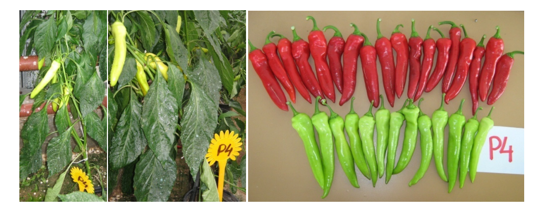
Fig. 4. Plants and fruits of androgenic genotype P4

The fruit was characterized with weight of 42.84 g, contains averagely 7.37% dry matter, 76.71% fruit flesh and 0.25 cm pericarp thickness. P4 fruit is classified as long, horn-shaped, medium-size and medium-fleshy pepper. The total yield gained in this research was 1.449 kg/m<sup>2</sup>. One plant was averagely loaded with 5.80 fruits weighting 231.90 g. According to production traits, in the given agroecological and cultivation conditions, it is a low-yield pepper genotype.