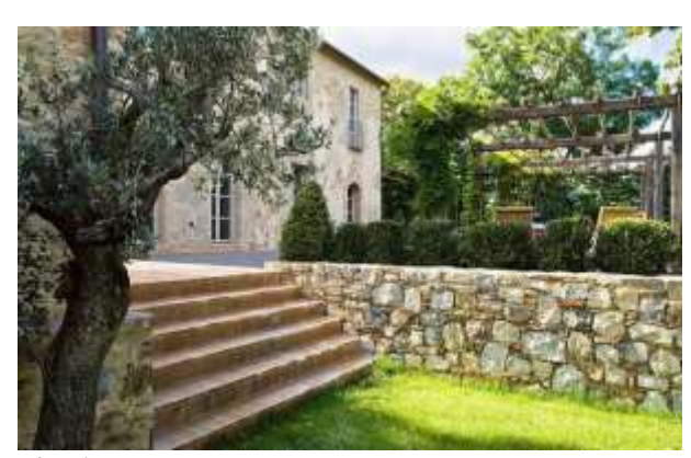
Fig. 6. Tuscany style

Decoration in Tuscan style is timeless appearance in decorating.