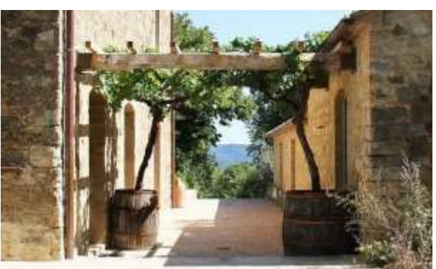
Fig. 5. Colors in Tuscan style