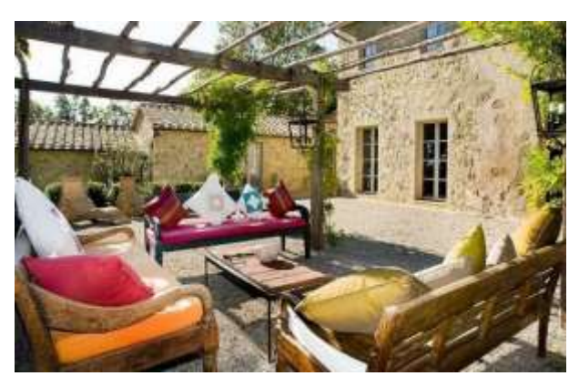
Fig. 3. Tuscany style exterior

The best place to experiment with Tuscan colors is living because it is usually neutral place.