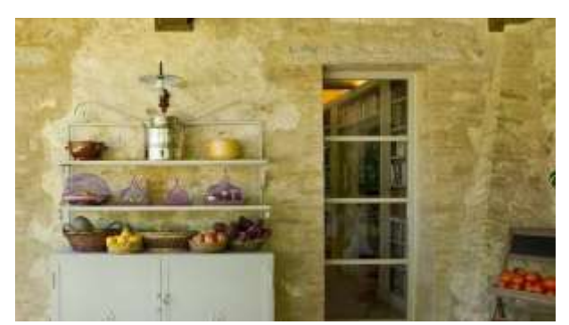
Fig. 2. Tuscany style decoration

particular feeling. The windows remain uncovered to take advantage of natural light.