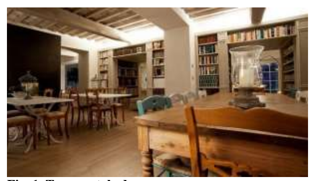
Fig. 1. Tuscan-style decor

Tuscany style developed under the influence of Tuscany village and also under the influence of architectural traditions of France and Spain.