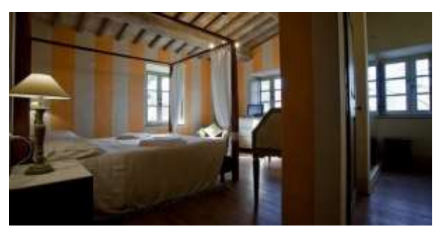
Fig. 4. Tuscan style furniture

The furniture in Tuscan style home usually dust, clean lines. The accents of wrought iron and marble are common.