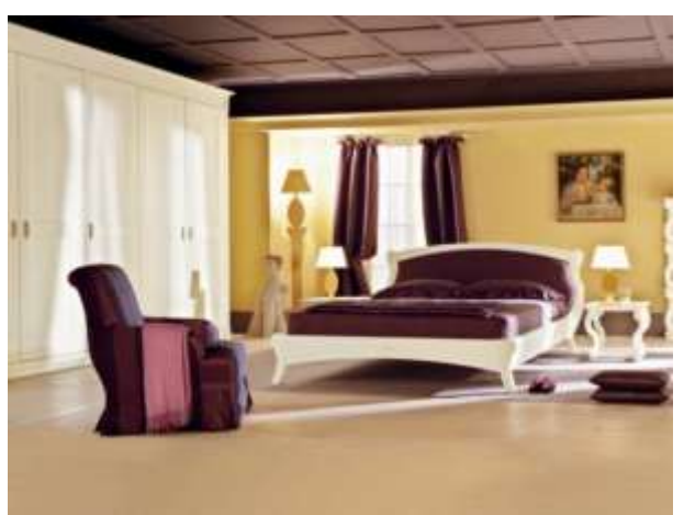
Fig. 7. The colors in the English style

Deep colors: green, cherry, terracotta - are distinctive black interior as a whole. The British used the effect of color depth. If the windows face south - for the walls is selected burgundy or green, north - lemon yellow or light green. That way the home reaches the same level of warmth of the colors.