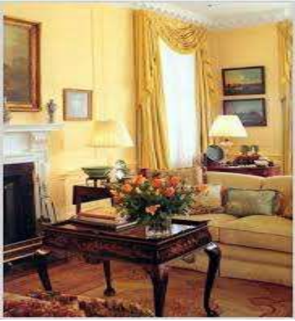
Fig. 6. English style furniture

In English interior attend massive elements. This also applies to furniture, and decorative elements. Interestingly, the massive details not burden the room, and conversely, help to create a cozy atmosphere in the situation when they selected appropriate materials and colors.