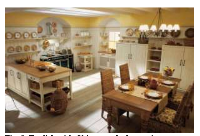
Fig. 8. English with Chinese style decoration

On the floor - carpet, oak planks, recently met and flooring. In any English interior is bent by the colonial style. In shaping his feelings and the whiff of Indian and Chinese art, there are products from the countries of the Caribbean. An era organically intertwined with each other. This creates a pleasant interior, which easily combine furniture from various periods miles widgets, for example - porcelain to which the British did not indifferent. Especially strong is the Chinese theme in porcelain.