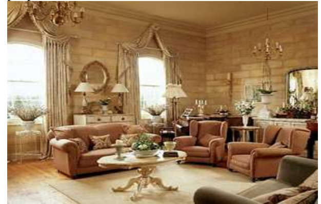
Fig. 5. English style furniture

English style home in the arrangement is popular throughout the world, regardless of culture or views of people.