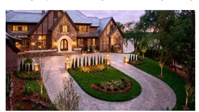
Fig. 1. English style garden

English landscape style with some influence which shifted formal symmetrical gardens for a freer, incorrect style. This style is inspired by the painting and its design is influenced by many disciplines such as history, philosophy and science. The innovative design of the English landscape style forever changed influences of gardening