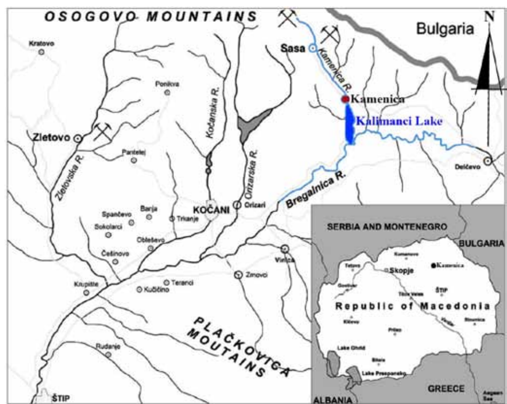
are connected with Lake Kalimanci with Kamenica River. Sl. 1. Karta obravnavanega območja. Rudnik in jalovišče Sase sta povezana s Kameniškim jezerom