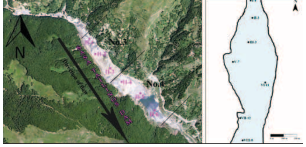
Sampling locations in Sasa tailings dam (left) and Lake Kalimanci (right), where Roman numerals indicate profile number. Sl. 2.