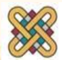
Faculty of Education University of Western Macedonia Florina