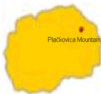
Fig. 1: Plačkovica Mountain as sampling area in R. Macedonia