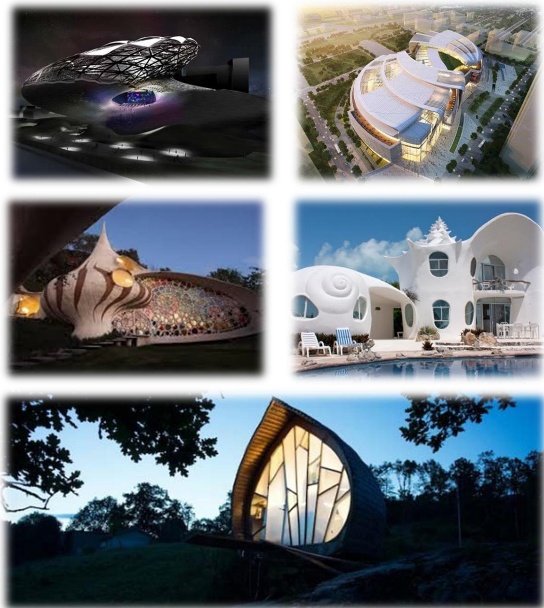
Figure 8. Architectural buildings inspired by the form of the shell

The beautiful, unique and irreplaceable form of the shell is one of the cutting-edge designs of nature. The shell was inspiring long ago. Primitive civilizations made drinking vessels and vases shaped as a shell. Later in the Greco-Roman period were created domes, spiral staircases and moldings on walls in the form of a shell. At the time of rococo one of the main features of this style was the decoration in the form of a shell. Today this form of inspiration is reflected in the design of furniture, decorative items, and even architecture.