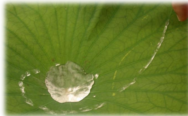
Figure 3. Lotus leaf

The bionic researches on the properties of materials are particularly important for the design. According to the principle called "lotus effect" characteristic of the lotus leaf, and thanks to the discovery that microscopic lumps covered with a layer of wax reject water drops and also removes dirt, it is designed a fabric and "Lotusan" color with properties of rejecting water and self-cleaning. These materials have a high potential for use in interior design.