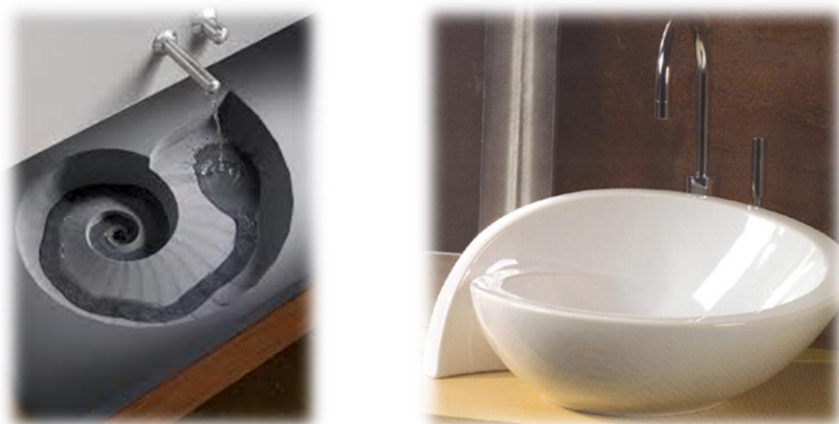
Figure 7. Sinks inspired by the form of the shell