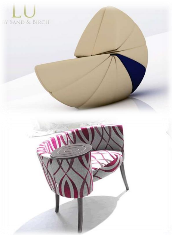
Figure 5. Sitting furniture inspired by the form of the shell

The form of the shells is inspiring form, and is often transformed into some kind of furniture, and even architecture. This form provides an opportunity for designers to create interesting shapes that will suit multiple purposes. There is an elegant line, and fits into any space perfectly. Starting from sofas, shelves, chairs, armchairs, sinks and other parts of the interior, the shape of the shell is found in whole architecture buildings. Such buildings have interior space that can be adjusted in an interesting living space and the external look is unusual and interesting.