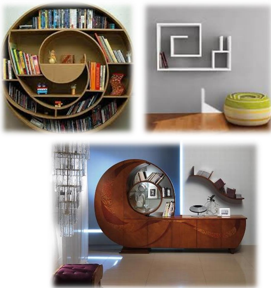
Figure 6. Shelves inspired by the form of the shell