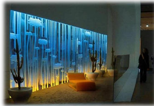
Figure 2. Anemix lighting– 3D effect

bacteria, insects and worms, create light to survive in a hostile and dark environment. The bionic inspired lighting "Anemix" in the interiors create a 3D effect. Imitating the natural process of bioluminescence not only promises better lighting, but also more efficient and effective lighting.