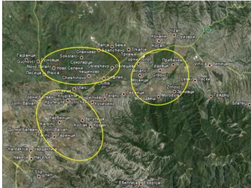
Figure 4. Municipalities which have gone over the limit of maximum allowed number of animals/ha

Having a case in which there has been no undertaken procedure for determination of the grass composition there are visible signs of disturbance of the limits between the pastures and the forests. The situation worsens further by uncontrolled grazing and in order to avoid further loss of bio balance a set of activities are necessary to be implemented, such are: