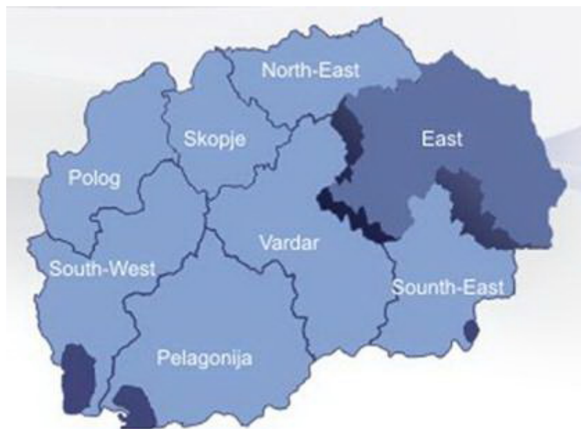
Figure 1. Territorial division of the Republic of Macedonia

In order to achieve targeted level of development a Program for Development of East Planning Region has been designed. In that Program special emphasis is given to the Development of agriculture and animal husbandry (Council for Development of East Planning Region, 2009).