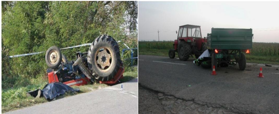
Fig. 1. Accidents with tractors and their tragic consequences

According to research data [8-10], in Republic of Serbia , in the period 1980-1988., over 900 tractor drivers (approximately 112 per year) were killed in various accidents and the locations (the movement of the tractor, down, or side-slope, improper towing tractor defective, others ride in a tractor in places that do not have a seat, driving speeding, rolling over, etc.). In direct accidents in public transport in Republic of Serbia (without provinces) from 1990 to 2000, the average number of tragically killed tractor drivers was 76 people.