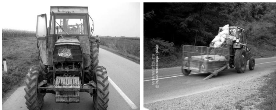
Fig. 3. Defective tractor units in the public transport of Serbia, [9], [22]

On the basis of the data presented, it can be concluded that there is a slightly decrease in the number of fatalities in accidents with tractors in the period 1990- 2009. The reason for reducing the number of people killed, in addition to the human factor is the influence factor of improving the technical characteristics of modern machinery and the tractors that are all over-represented in agriculture of Serbia (additional safety devices, cab signaling and alarm systems, etc.).