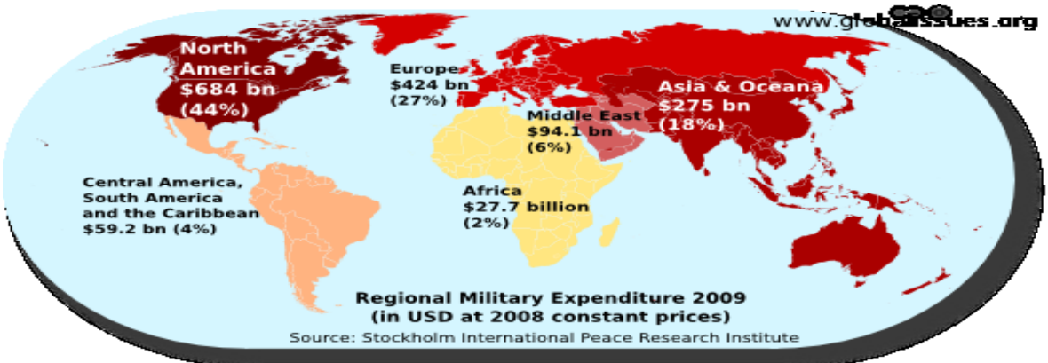
Table 2: Military spending is concentrated in North America, Europe, and Asia (Shah, 2010)