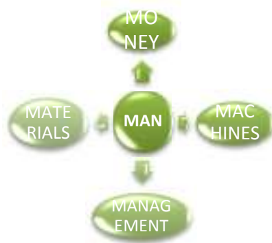
Figure 1. The five M factors in the company